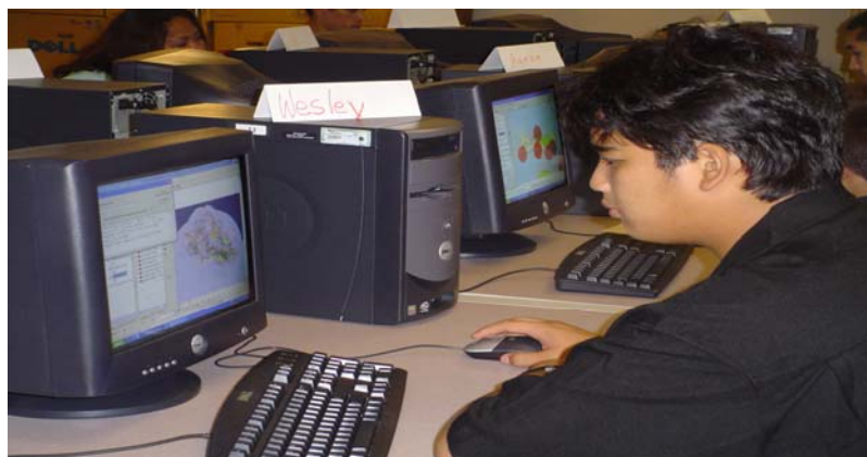
King Kekaulike High School student at GIS training