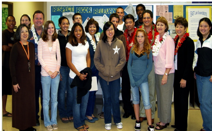
EAST students meet Legislators (2007)

Act 271 directed funding towards the umbrella organization of the Economic Development Alliance of Hawaii (EDAH) through the 3Ts Program established in 2006 (Chapter 302A-1314, HRS). Although the Governor valued the EAST program, there were strong reservations concerning the funding mechanism as indicated in the 3Ts statute. Therefore, it was decided that funding would be provided through a contract entered into by the Department of Business, Economic Development & Tourism (DBEDT) and EDAH. Currently, EDAH is still under contract with DBEDT for Project EAST expansion statewide. This contract will run through June 30, 2009.