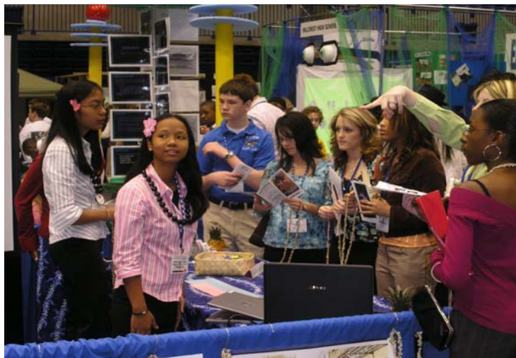
Lahainaluna High School EAST students at 2007 National EAST Conference