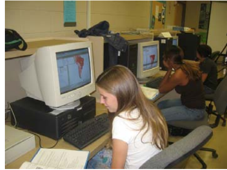
Maui High School student at GIS training

McKinley High. All four schools were invited to a Maui EAST site visit (Mililani was invited, but unable to make it). The tour provided an opportunity for the new schools to visit, and have access to successful EAST programs. Kapolei High has since withdrawn and recruitment is ongoing to add another school.