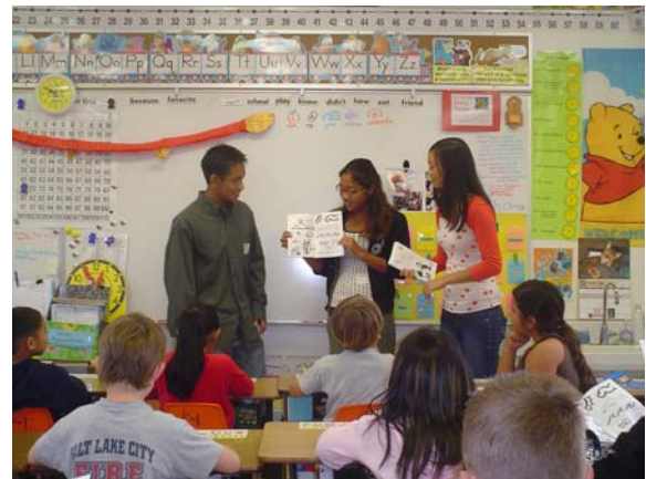
National GIS Day, 2007