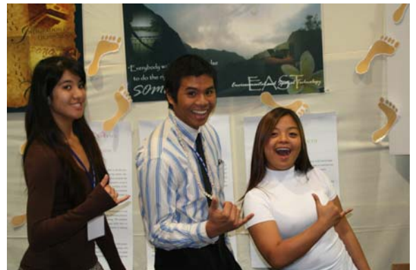
Maui High School EAST students