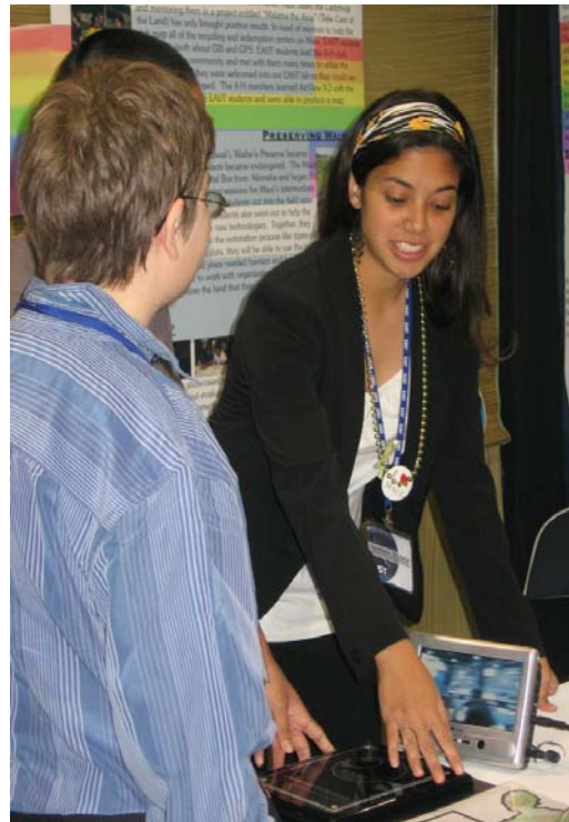
Maui H.S. student at 2007 EAST National Conference