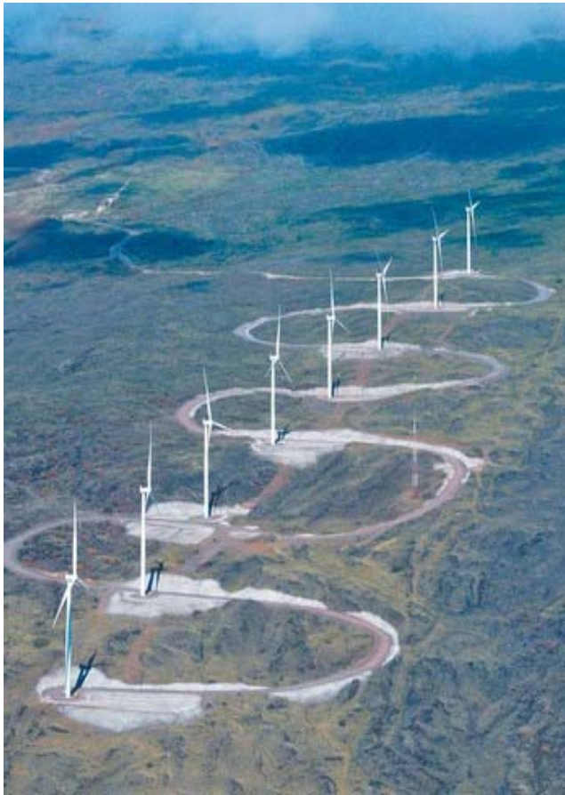
Auwahi Wind Farm, Sempra Generation (Ulupalakua Ranch, Maui)