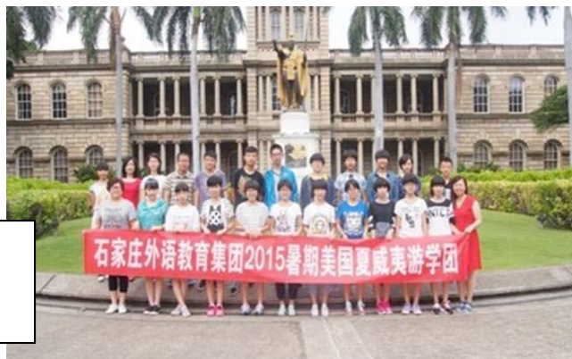
Delegation of high school students from China in Hawaii for short-term study program

As a result of the BAPSTE delegation visit to Hawaii, 129 Chinese students and teachers traveled to Hawaii for a short-term programs which included visits to the University of Hawaii-Hilo, Mid-Pacific Institute and other Study Hawaii member institutions. The 129 students and teachers accounted for an estimated $384,000 in direct spending, $829,000 in combined total direct and indirect impact on the state's economy, $345,278 in household earnings attributable to the group, and generated $54,000 in state tax revenue.