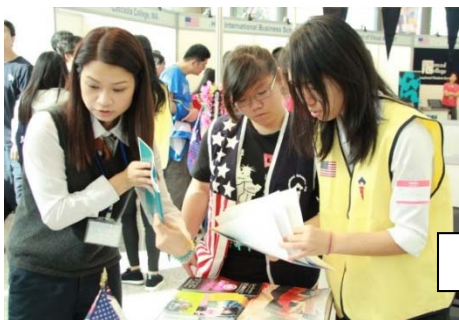
SHOT staff at the American International Education

Due in part to the marketing efforts of SHOT staff, close to 400 students from Taiwan studied in Hawaii for 2014 and 2015. More than half of Taiwanese students enrolled in short-term programs with an estimated direct economic impact of $8 million and creating close to 200 jobs. Over $17 million in household spending can be attributed to students from Taiwan, generating over $1.1 million in state tax revenue.