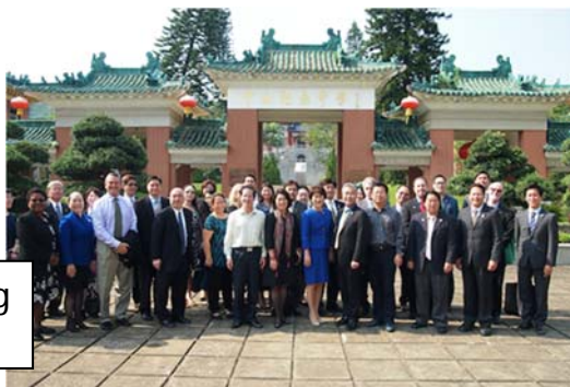
Governor Ige and Study Hawaii delegation visiting Sun Yat-sen Memorial Museum in Zhongshan

efforts to send more of their students on study abroad programs including U.S. universities upon graduation.