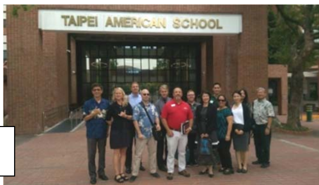
Delegation visiting the Taipei American School

SHOT also produced for the delegation, The Study Hawaii Education Seminar. A Hawaii-Taiwan education fair that attracted 120 guests representing Taiwan universities and colleges, high schools, education counselors, English language schools, immigration consultants, alumni, education ministry officials, and even the education specialist from the American Institute in Taiwan. The seminar provided individual schools the opportunity to market their school and programs targeting international students. The seminar also provided participants the opportunity to meet with school representatives on a one-to-one basis.