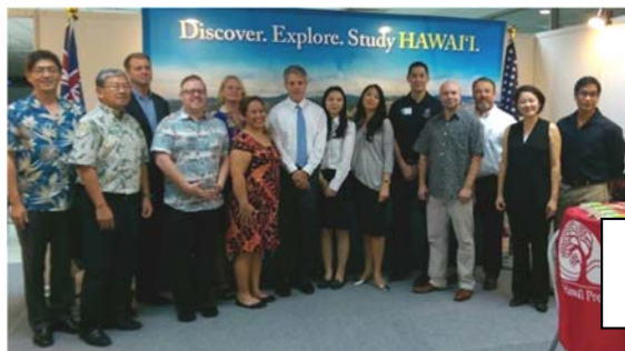
Study Hawaii delegation at the Oh! Study International Education Expo

The Department of Business, Economic Development & Tourism (DBEDT) along with Study Hawaii (a consortium of schools dedicated to increasing the number of international students studying in Hawaii) organized the second Study Hawaii Mission to Taipei from October 8-11, 2015. Study Hawaii's participating schools included Global Village Hawaii, Hawaii Pacific University, Hawaii Tokai International College, University of Hawaii System, University of Hawaii at Hilo, University of Hawaii at Manoa, University of Hawaii English Program, Hawaii Community College, Kapiolani Community College, University of Hawaii Outreach College. The delegation members actively promoted programs for international students at the Hawaii Pavilion at the Oh! Study International Education Expo to parents and students. More than two hundred prospective students were interviewed at the expo for further school follow up. In addition to the education trade show, SHOT also arranged a breakfast briefing by education specialists from the American Institute in Taiwan, EducationUSA and the Fulbright program. The delegation visited the Taipei American School which sends many of its students on study abroad programs.