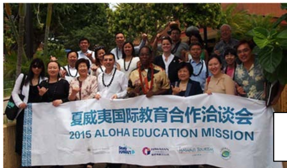
BAPSTE delegation visit to Hawaii Pacific University campus

In April 2015, SHOB worked with the Beijing Association for Promoting Sci-Tech Education (BAPSTE), a nonprofit organization focused on developing activities and events in the areas of science and technology, to organize a delegation of Chinese educators from 10 schools to visit Hawaii and meet with schools interested in attracting students from China.