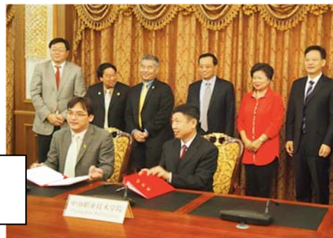
Kapiolani Community College signing MOU with Zhongshan Vocational Technical Institute