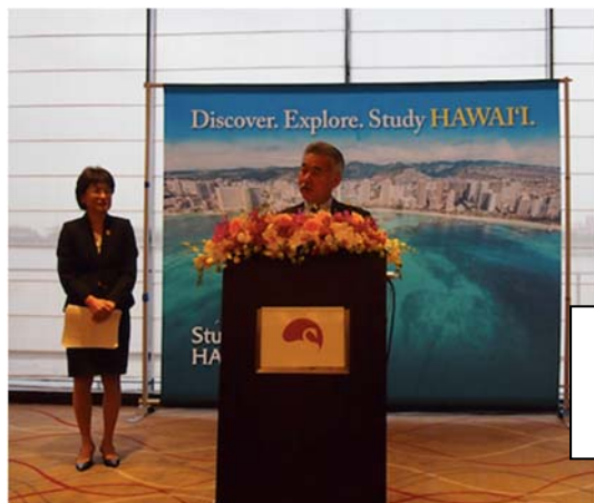
Governor Ige and First Lady providing welcome remarks to the Study Hawaii Education Seminar in Guangdong