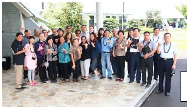
BAPSTE delegate visit to Imiloa Astronomy Center