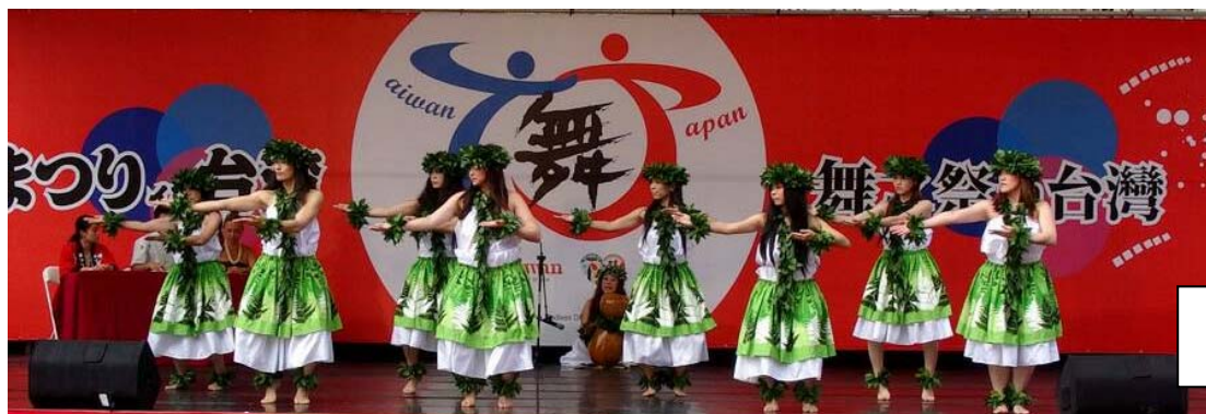
Hula in Taiwan