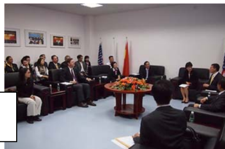
Governor Ige and First Lady meeting with Guangdong Governor Zhu

As part of the mission, SHOB, the Guangdong Foreign Affairs Office, the Provincial Ministry of Education, and the U.S. Consulate General in Guangzhou selected 5 high-performing high schools for the delegation to visit while in Guangdong. Led by Governor Ige and the First Lady, the Study Hawaii delegation was briefed by each school on their