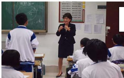
First Lady answering questions posed by high school students in Guangzhou