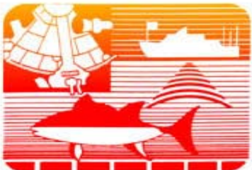
TABLE of CONTENTS, Exec Summary