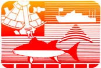
TABLE of CONTENTS, Exec Summary