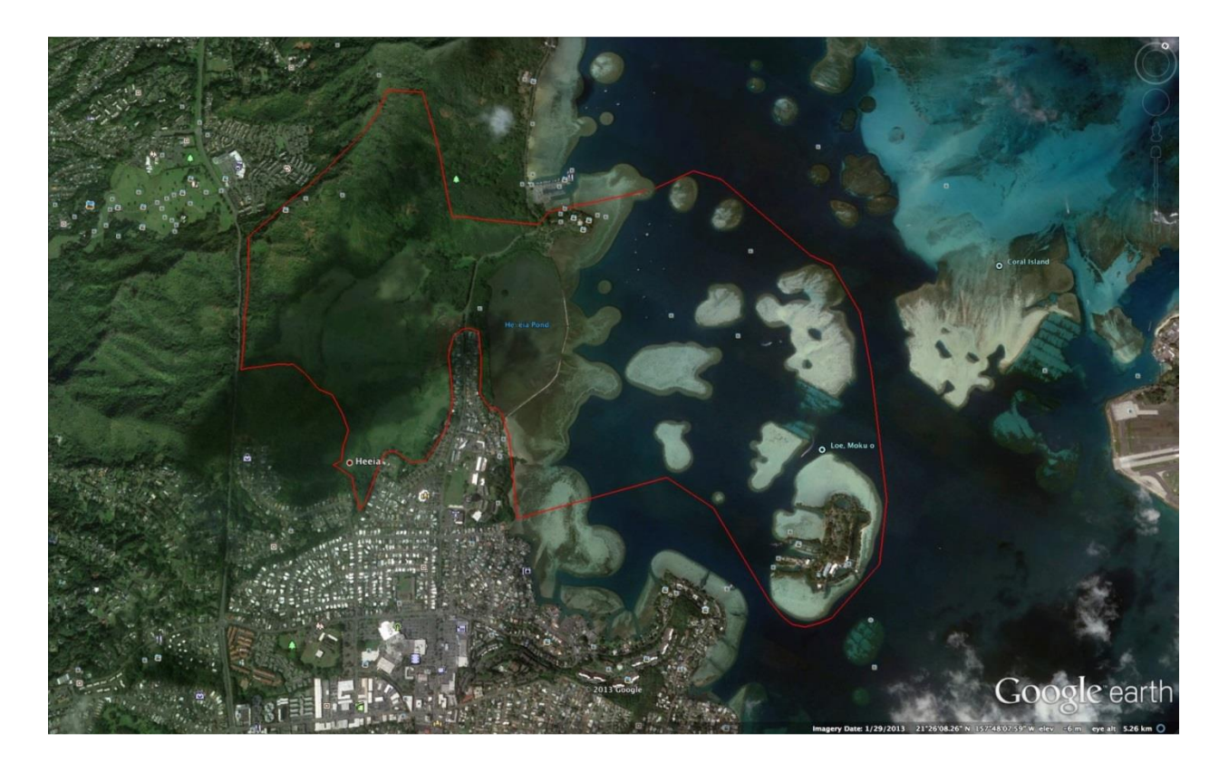
Figure 2. Original He'eia NERR site boundaries proposed by the He'eia site partners for the site selection process in April, 2013.

boundaries are being evaluated in the NOAA designation process and in the development of the management plan. Additionally, the management plan has a section on Land Acquisition that can identify and consider changes in the boundaries as part of future management actions. If you have a suggestion about areas to include or exclude in the NERR boundary, please submit it using the <u>Written</u> <u>Comment Form</u>.