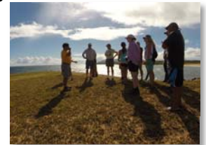
MACZAC members visiting Mo'omomi CBSFA on Molokai (September, 2014)

In order to learn more about current issues in Hawaii, MACZAC holds one meeting each year on a neighbor island and includes in the meeting agenda a site visit to an area of interest.