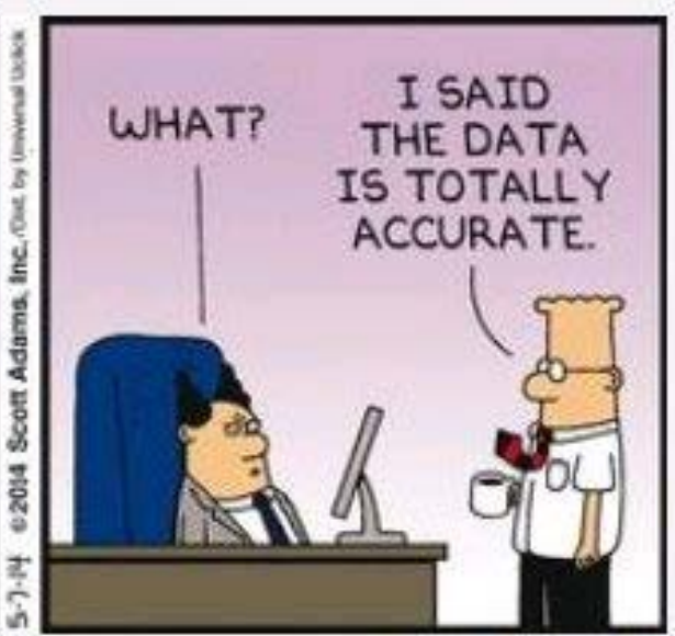
Dilbert by Scott Adams - May 7, 2014

Universal Uclick grants you a limited, personal, non-exclusive, non-commercial, revocable, non-assignable and non-transferable license to download, view and/or play one copy of the Materials (excluding source and object code) on any single computer for your personal, non-commercial use only, provided that you keep intact all copyright and other proprietary notices contained in the original Materials or any copy you may make of the Materials.