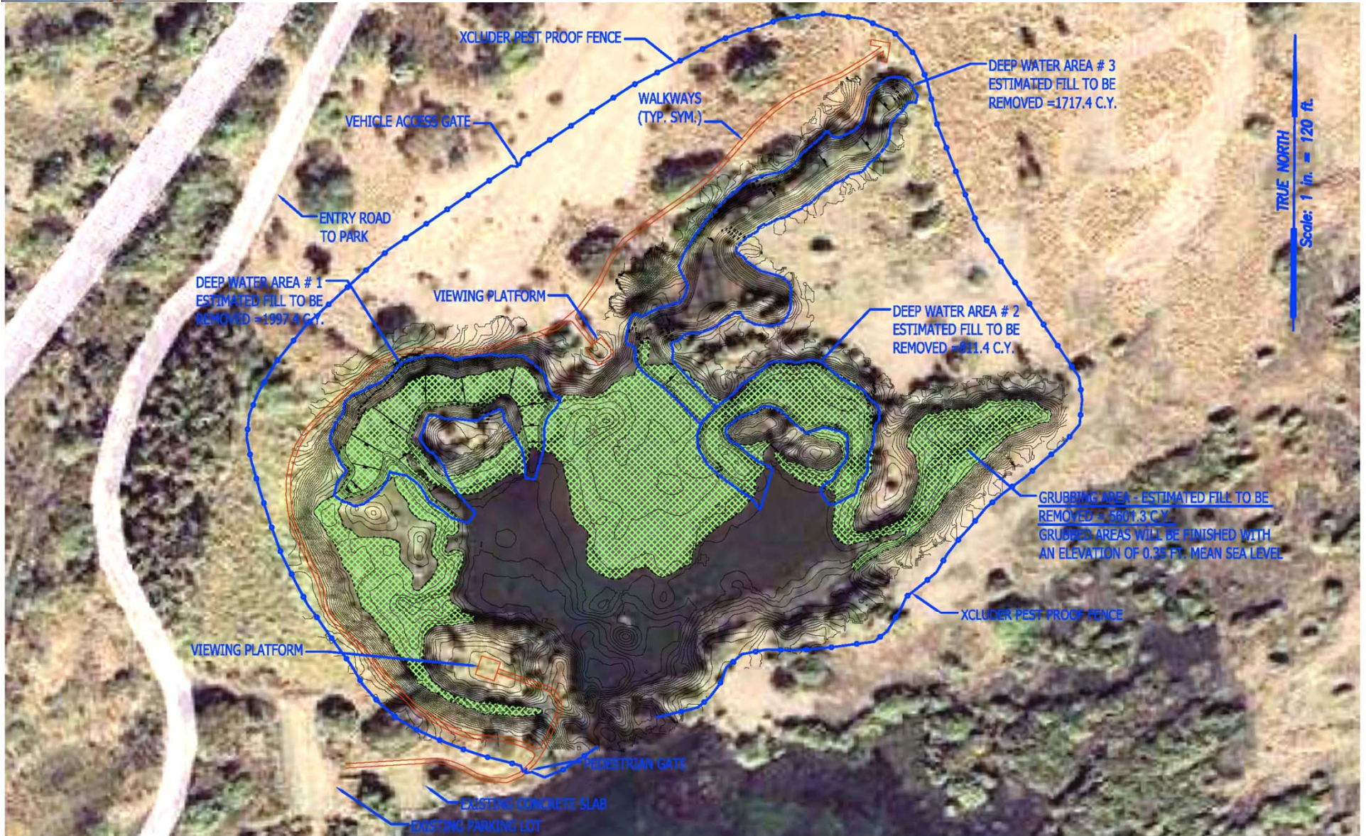
GENERAL PLAN Honu'apo Wetlands Restoration 1"=120' scale Contour Interval = 0.35 foot