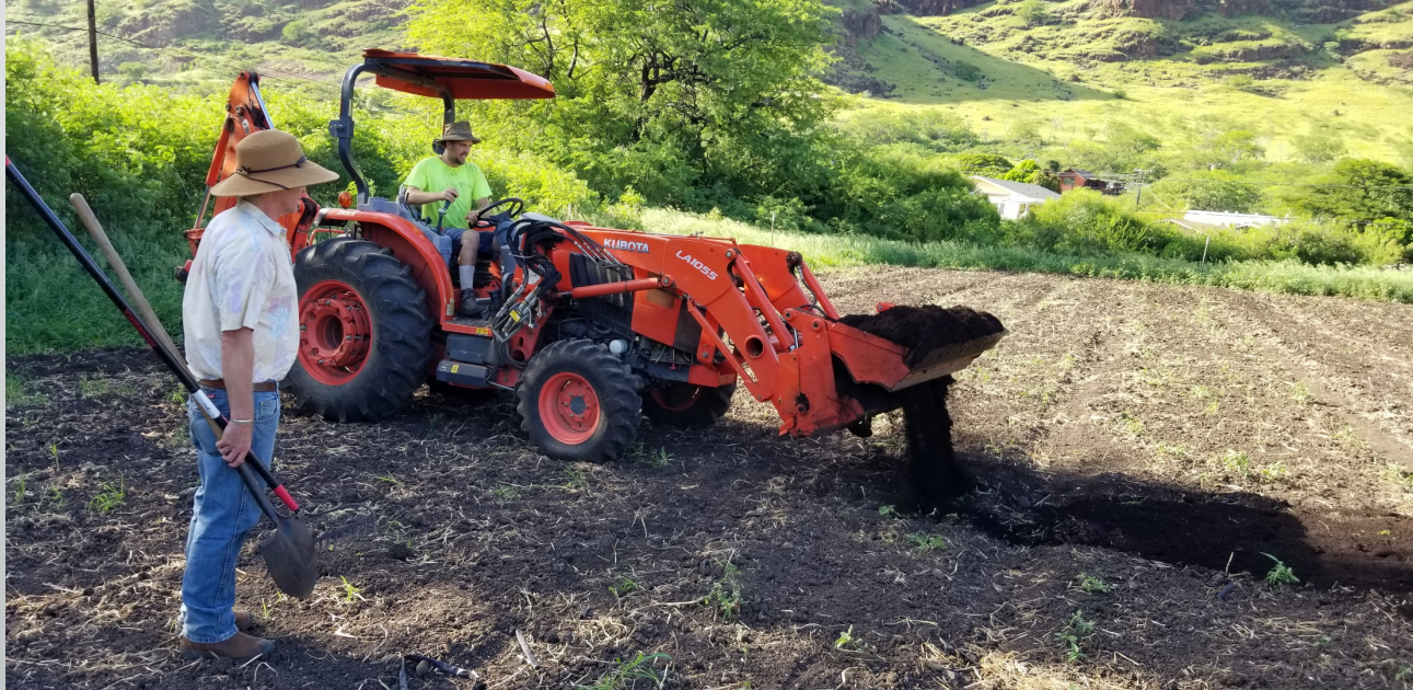
Compost, Organic Soil Amendments