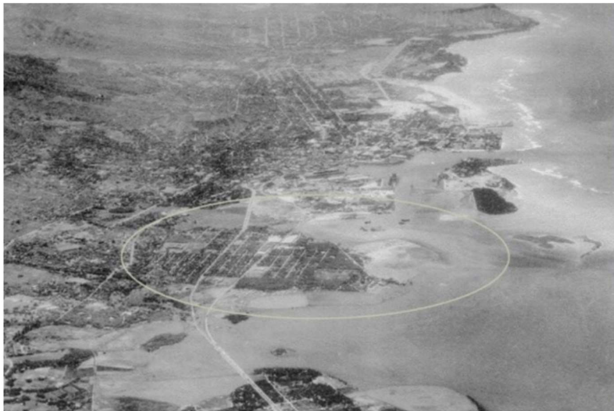
22 loko i'a (fishponds) were recorded in Niuhelewai and Kapālama in the mid-nineteenth century. Kamehameha was responsible for many of these loko i'a.