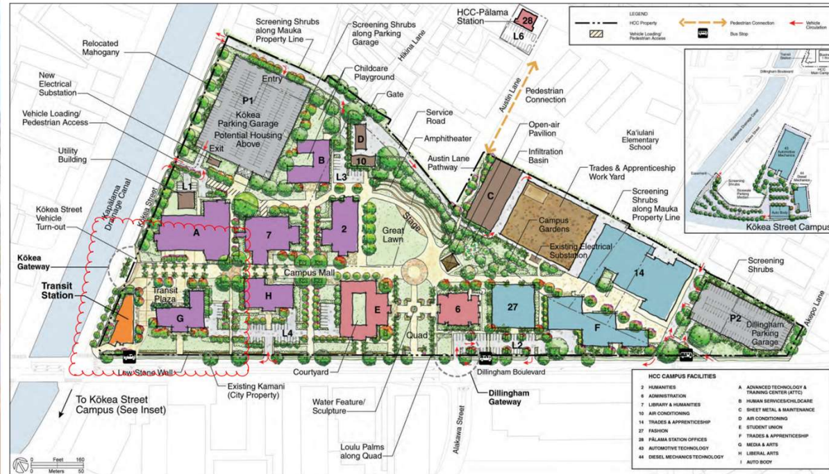
ULTIMATE CAMPUS PLAN