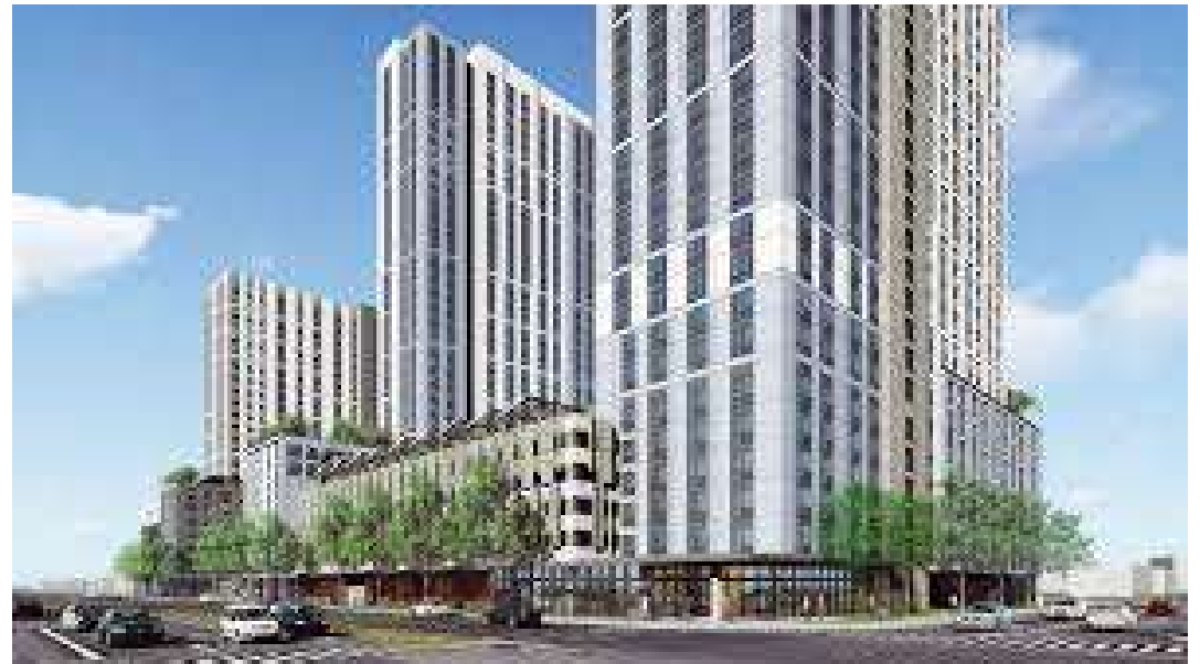
Mayor Wright Housing Redevelopment