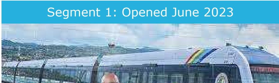
Segment 1: Opened June 2023