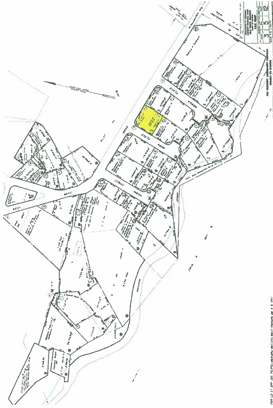
Exhibit 3 (a) TMK of relevant parcel highlighted (zoomed out)

BIRNIE, ALAN TMK #: 3-5-012-010 WATER USE PERMIT APPLICATION - EXISTING USE