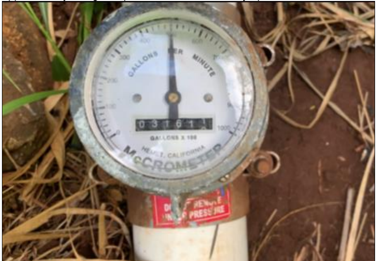
Photo 1. Wailuku Town Kuleana Pipeline distribution point meter showing approximately 500-gallon per minute flow with a fully-opened valve.

On October 29, 2021, Commission staff conducted a site visit at 9:00 a.m. with a representative from Senator Lorraine Inouye's office and the assistance of a Maui Division of Conservation and Resources Enforcement (DOCARE) officer. Staff met with Mr. Chumbley and Mr. Dean Wong, of Imua Family Services, to inspect the valve on the Wailuku Town Kuleana Pipeline distribution pipe located at the boundary of the Imua Family Services property as well as to understand the use of water on-site. WWC was asked to fully open the valve on the 3-inch line to observe the maximum flow (in gallons per minute, gpm) in the pipeline (Photo 1)