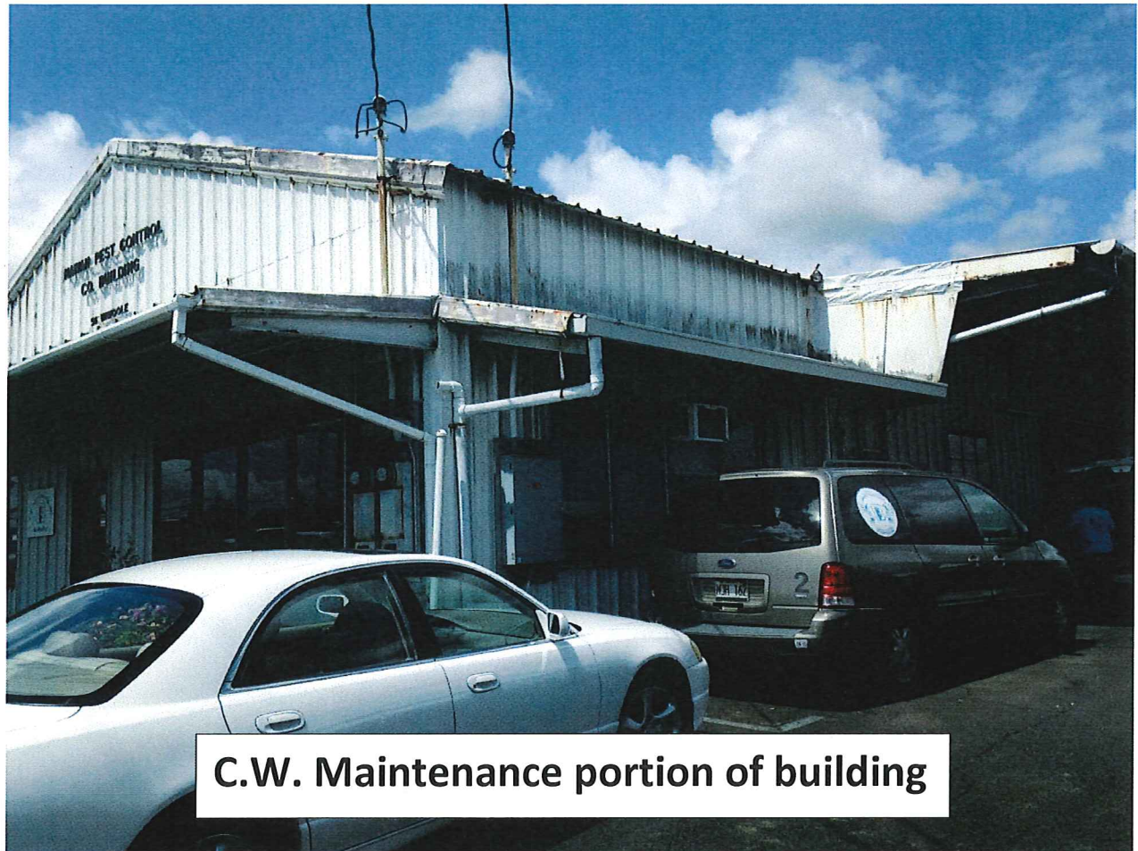
C.W. Maintenance portion of building