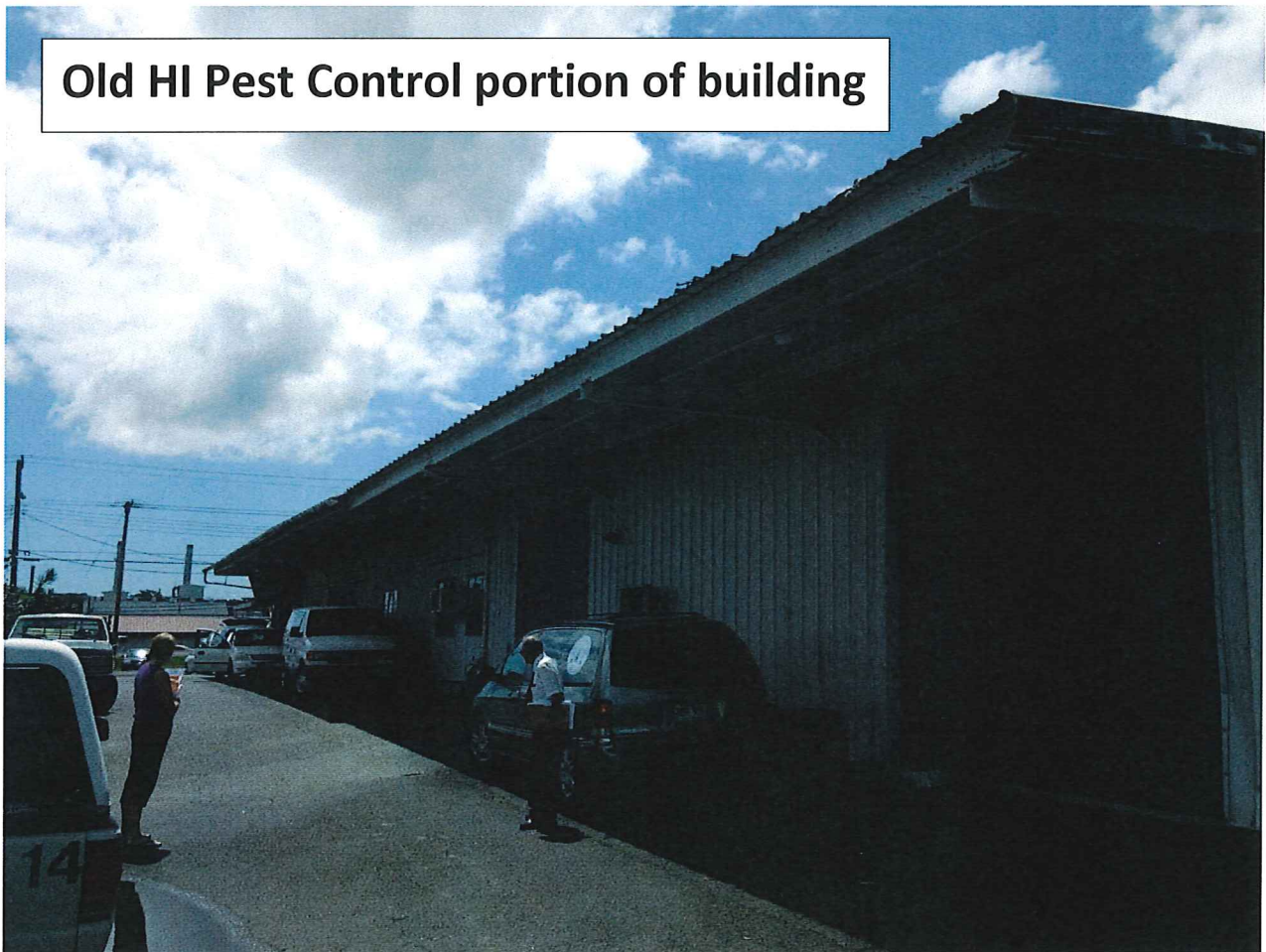
Old HI Pest Control portion of building