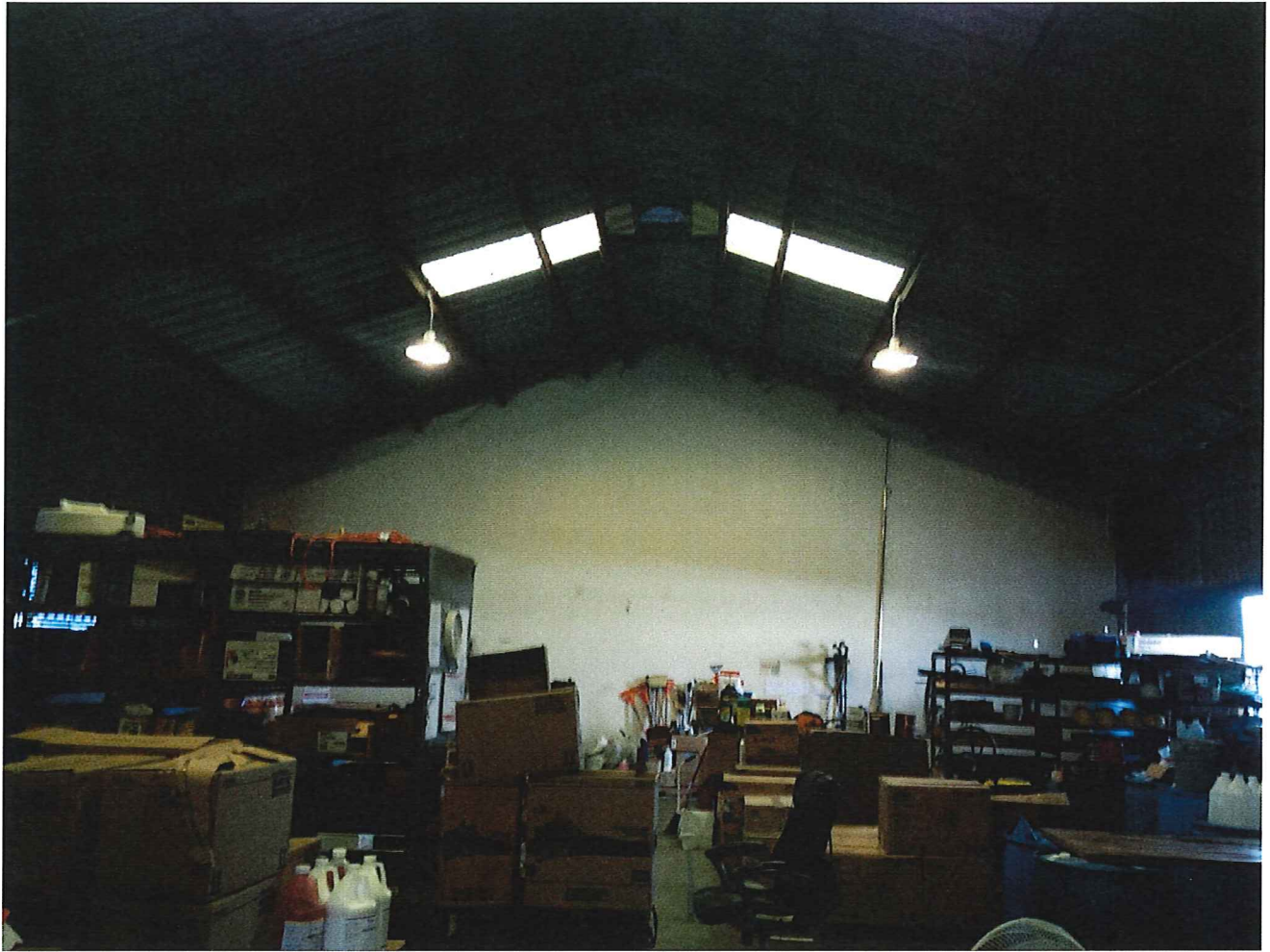
C.W. Maintenance storage room