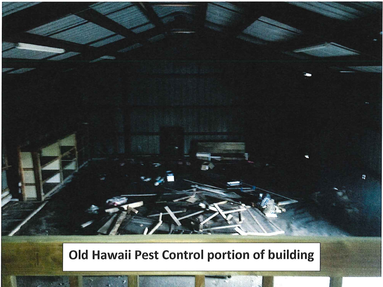
Old Hawaii Pest Control portion of building