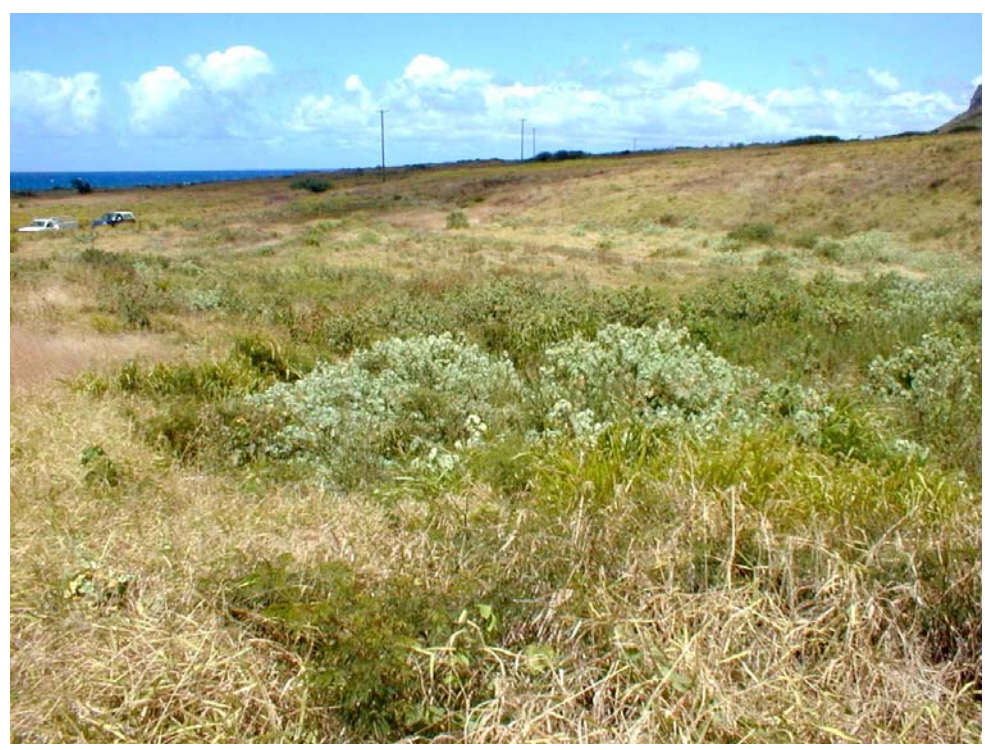
Abutilon menziesii at Kapolei, Island of O'ahu

Garden population will function as a protected repository for the full genetic stock of the Kapolei population. The Kealia Trail site was an experimental site to test the biological requirements of the plant.