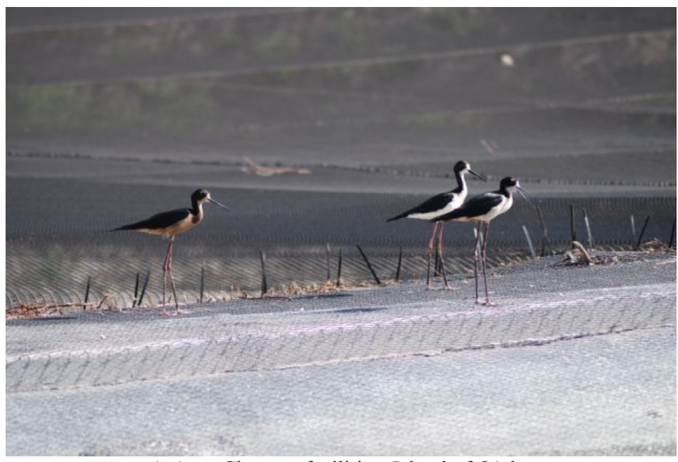
Ae'o at Chevron facilities, Island of O'ahu

During the 2008 breeding season, no take incidents of juvenile or adult stilts were recorded. Chevron continues to manage water level at the ponds per the SHA for ae'o and 'alae ke'oke'o. After problems with non-compliance in predator control on site in 2006, Chevron has been diligent in their predator trapping and other SHA-related management activities. DOFAW has recently met with USFWS and Chevron on updating the SHA, and working toward off-site mitigation at Pouhala Marsh, under a future HCP for the project. The Endangered Species Recovery Committee has scheduled review and discussion of the SHA for its October 2008 meeting.