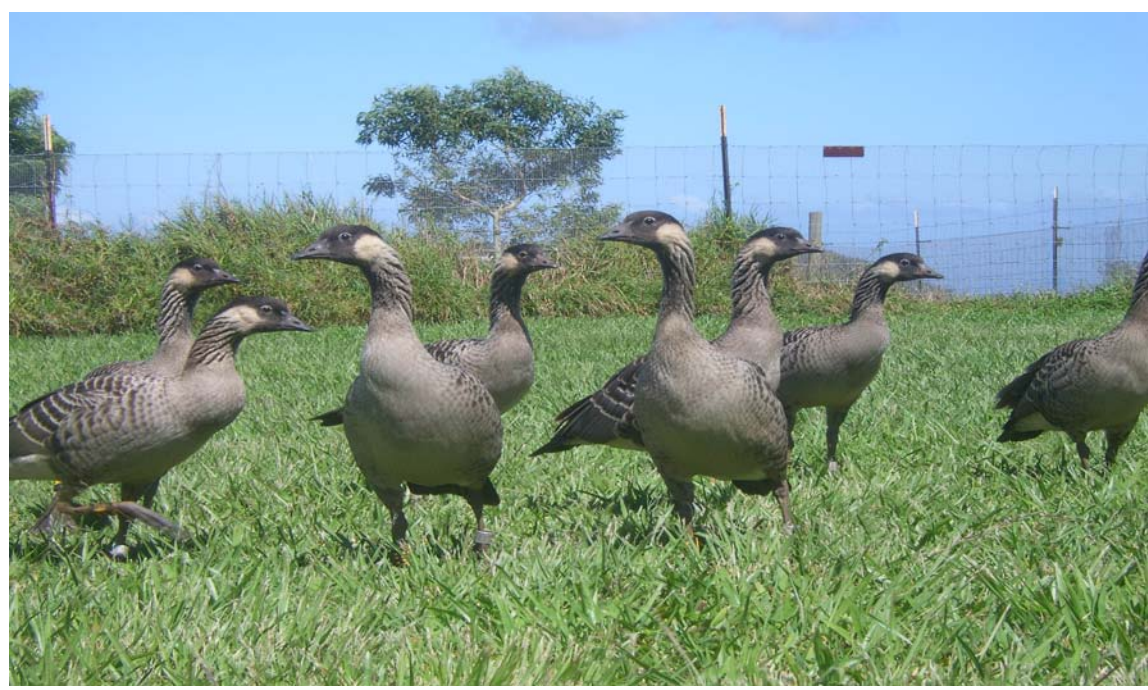
Fledglings released at Pi'iholo Ranch