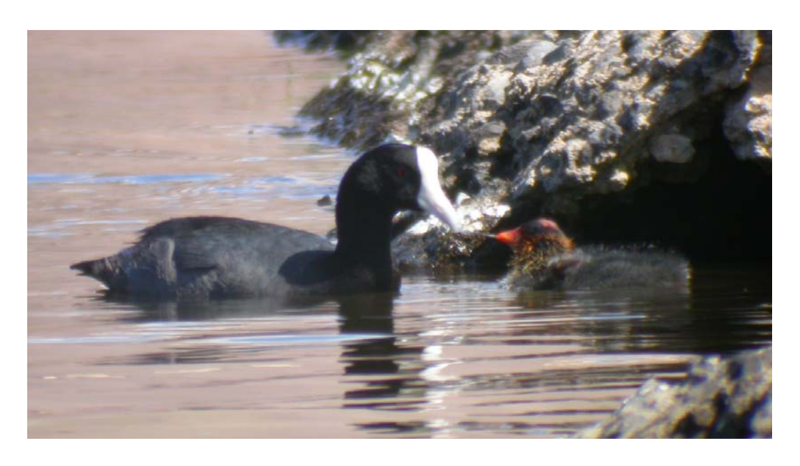
'Alae ke'oke'o and keiki at Chevron facilities, Island of O'ahu