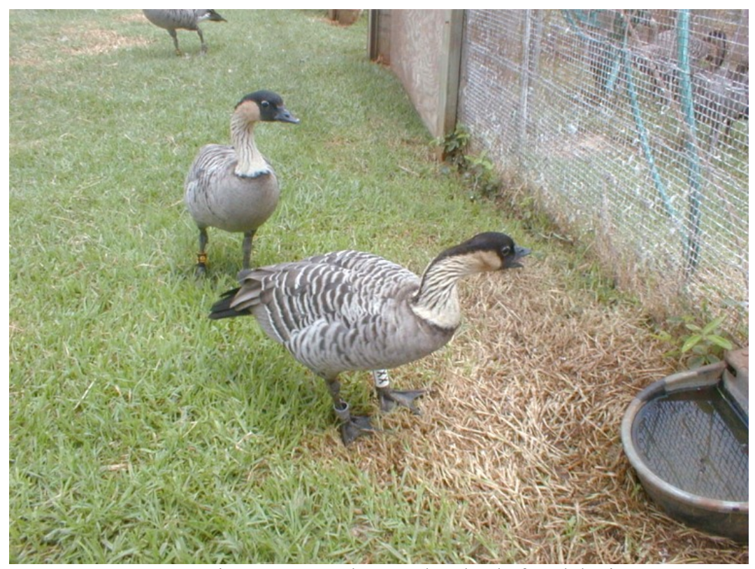
Nēnē pair at Pu'u o Hoku Ranch, Island of Moloka'i

and eighty-seven (87) were Molokai birds. In addition to the 120 nēnē, thirty-six (36) fledglings were captured and fitted with State and Federal bands.