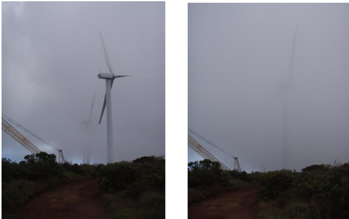
Figure 7. Two photos taken from the same point, seconds apart, at the Kaheawa Pastures Wind Facility, Island of Maui. While superficially it may seem that birds or bats could avoid striking something as large as a turbine, the photos illustrate how avoidance is sometimes difficult; this problem is compounded at night (for visual animals) and during low wind periods (for bats).