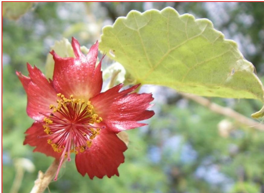
Figure 3. Ko‘o loa ‘ula ( Abutilon menziesii ) at Kapolei, Island of O‘ahu.

This HCP was developed to cover the impacts and measures that will be taken to mitigate the impacts to the endangered plant species, ko‘o loa ‘ula ( Abutilon menziesii ) (Figure 3, Table 3), that are present on a 1,381-acres of state and city-owned property, which is the site of the proposed construction of the North-South Road Highway, Kapolei Parkway and subsequent developments. The Department of Transportation (DOT) is the HCP and license holder, the implementation of the HCP mitigates for the impact of development actions that may be conducted by DOT and other agencies/organizations in the area. To date, Certificates of Inclusion, which authorize incidental take to third parties, have been issued to the Department of Hawaiian Home Lands, the University of Hawaii, and the City and County of Honolulu.