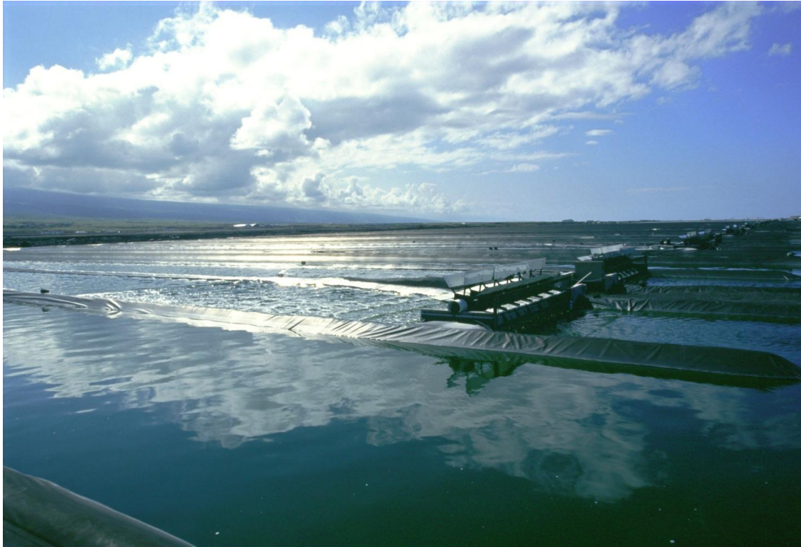
Figure 2. Cyanotech Facility, Big Island (Hawai'i).

During Fiscal Year (FY) 2009, the nesting habitat and Ducks Unlimited raceway continued to be maintained in a manner unusable to the stilts. Cleaning the Spirulina production raceways reduces the invertebrate food source. As per the conservation plan, surveying for incidental take was conducted twice per week during the nesting season and once per week during non-nesting season. However, monitoring for injured or dead stilts was conducted daily as part of normal operations of the production raceways. Surveying the raceways for debris was conducted daily in an effort to protect the mechanical and harvest systems of the production raceways. Surveying the raceways visually is conducted first thing in the morning, before the paddlewheels were turned on. The total amount of incidental take at Cyanotech for 2009 was zero.