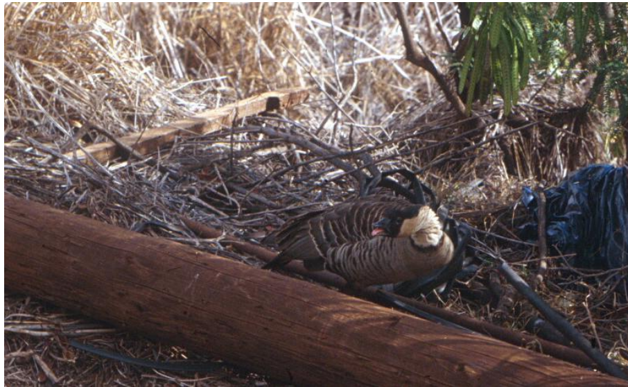
Figure 6. Nēnē and nest at Lahainaluna, Maui. Some of the birds released at the Hana‘ula site have continued to use the release pen, but many others have successfully dispersed and are expanding the breeding population across West Maui. There are now wild born breeding adults in this area. (Smith, DOFAW 2009)

Implementation of the provisions under this HCP has resulted in reduced take of endemic Hawaiian species. Cooperative efforts with the applicant, DOFAW and USFWS should provide net benefit to the species, when mitigation efforts are implemented to offset authorized incidental take. A more detailed report of the project is available in the “Kaheawa Pastures Wind Energy Generation Facility Habitat Conservation Plan Year 2 HCP Implementation: July, 2007 – June, 2008” (First Wind Environmental Affairs 2008).