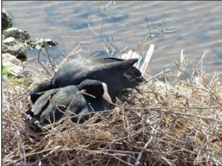
Figure 5. 'Alae ke'oke'o (Hawaiian coot) nesting at Chevron facility, O'ahu (URS Corp 2009).

should current management activities appear ineffective. In addition, Chevron conducts an education program for its employees and contractors about the ae'o and 'alae ke'oke'o at the Refinery.