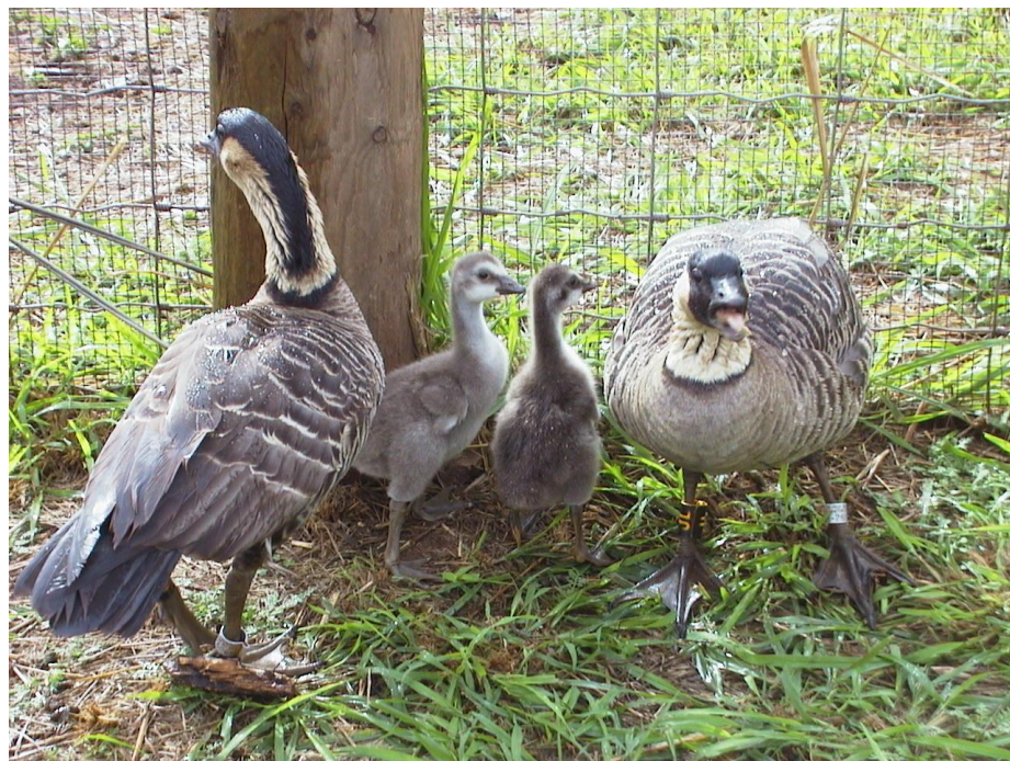
Figure 1. Nēnē gander protecting chicks. Pu‘u o Hoku Ranch, Moloka‘i.

The Pu‘u o Hoku Ranch SHA has been a tremendous success. The Moloka‘i nēnē population has increased from 0 to 173 birds in eight years, with 74% of those birds being wild born on Moloka‘i as a direct result of the Pu‘u o Hoku Ranch SHA activities. The Ranch is continuing to review the possibility of renewing the SHA in the future.