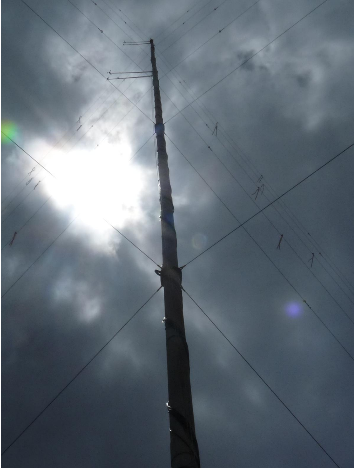
Figure 8. Guy wires on one of the meteorological towers on Lānaʻi, covered under the HCP. Guyed towers pose a much higher collision risk for seabirds and bats than do unguyed towers.