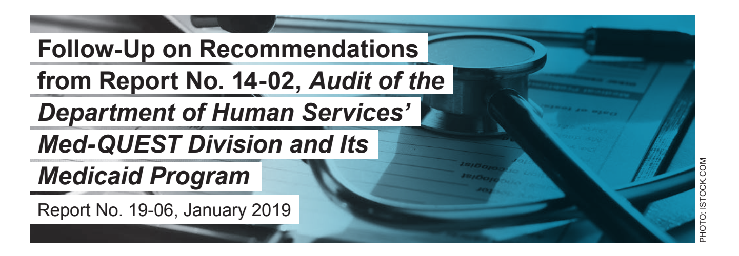
Section 23-7.5, Hawai'i Revised Statutes, requires the Auditor to report to the Legislature annually on each audit recommendation more than one year old that has not been implemented by the audited department or agency. This report presents the results of our review of 19 recommendations made to the Department of Human Services in Report No. 14-02, Audit of the Department of Human Services' Med-QUEST Division and Its Medicaid Program.

THE 2013 LEGISLATURE directed the Office of the Auditor to conduct a comprehensive financial audit of the Department of Human Services' (DHS) Med-QUEST Division, with emphasis on the Medicaid program. With state contributions to the Medicaid program nearly doubling from FY2010–FY2015, the Legislature was concerned about the relevance and usefulness of the information it receives from the division.