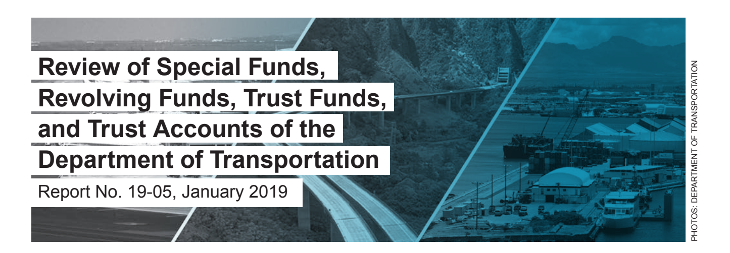
Section 23-12, Hawai'i Revised Statutes (HRS), requires the Auditor to review each department's special, revolving, and trust funds every five years. Although not mandated by statute, we included trust accounts as part of our review. This is our sixth review of the Department of Transportation's (DOT) revolving funds, trust funds, and trust accounts, and our second review of DOT's special funds.

WE REVIEWED 377 funds and accounts administered by DOT and reported on 46 of them – specifically, 14 special funds, 21 revolving funds, 5 trust funds, and 6 trust accounts. We found 5 special funds, 17 revolving funds, 1 trust fund, and 1 trust account did not meet criteria – specifically, 16 revolving funds should be reclassified as trust accounts and 1 trust account should be reclassified as a trust fund; 2 special funds should be evaluated to determine whether they should be closed; and 3 special funds, 1 revolving fund, and 1 trust fund should be closed.