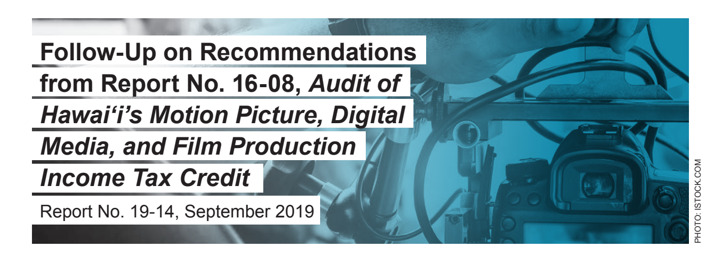
Section 23-7.5, Hawai'i Revised Statutes (HRS), requires the Auditor to report to the Legislature annually on each audit recommendation more than one year old that has not been implemented by the audited department or agency. This report presents the results of our follow-up on the Department of Taxation (DoTAX) and the Hawai'i Film Office's implementation of the nine audit recommendations made in Report No. 16-08, Audit of Hawai'i's Motion Picture, Digital Media, and Film Production Income Tax Credit, which was published in November 2016.

IN 2016, we found that DoTAX had broadened the scope of the film tax credit to include out-of-state expenses subject to tax under Chapter 238, HRS, as "qualified production costs" eligible for the credit. We reported that DoTAX's implementation of the tax credit was inconsistent with the plain language of the statute and the Legislature's intent for the incentive to stimulate economic growth, which increased the cost of the film tax credit to the state. Expenditures paid to out-of-state businesses and service providers do not infuse money into Hawai'i's economy or provide income for local residents, nor do they create local jobs.