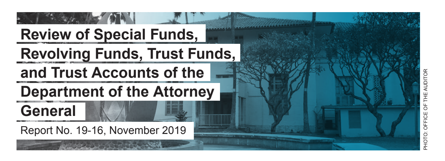
Section 23-12, Hawai'i Revised Statutes, requires the Auditor to review all existing special, revolving, and trust funds every five years. Reviews are scheduled so that each department's funds are reviewed once every five years. Although not mandated by statute, we include trust accounts as part of our reviews. This is our sixth review of the Department of the Attorney General's (AG) revolving funds, trust funds, and trust accounts, and our second review of the AG's special funds.

WE REVIEWED 21 funds and accounts administered by the AG and reported on 19 of them. We found two revolving funds, two trust funds, and two trust accounts did not meet criteria. We recommended two revolving funds and one trust fund be reclassified as special funds, one trust fund be reclassified as a trust account, one trust account be reclassified as a trust fund, and one trust account be closed