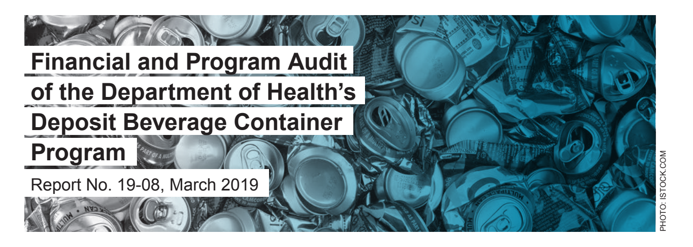
Section 342G-17, Hawai'i Revised Statutes, requires the Office of the Auditor to conduct a management and financial audit of the Deposit Beverage Container Program in fiscal years ending in even numbers. We contracted KMH LLP (KMH), a certified public accounting firm, to conduct this financial and program audit for the fiscal year ended June 30, 2018.

AS IN PRIOR YEARS' AUDITS, we found that the program has failed to develop and execute procedures to verify the accuracy and completeness of data used to support claims of the deposit and container fees paid to the program by the distributors as well as deposits and handling fees paid to the redemption centers. Without such procedures, the program relies on self-reported data and accepts that cash receipts from the distributors and payments made to redemption centers are accurate and complete. As a result, KMH's testing found inaccuracies and possible fraudulent reporting in the data used in the aforementioned calculations. For example, during KMH's detailed testing of 24 distributors. KMH found exceptions in 6 distributors' records supporting their claims about the number of beverage containers. One distributor did not respond to KMH's request for supporting records or schedules. Two others could not provide information on container count, container fee. and deposit amounts. As a result, KMH could not fully complete its testing.