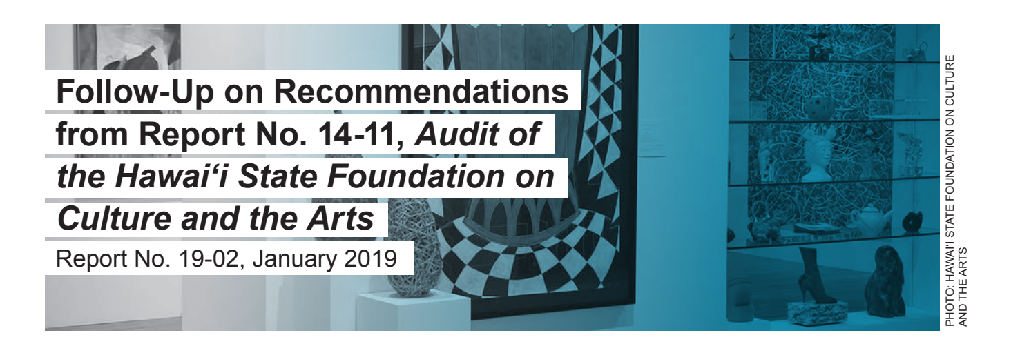
Section 23-7.5, Hawai'i Revised Statutes (HRS), requires the Auditor to report to the Legislature annually on each audit recommendation more than one year old that has not been implemented by the audited department or agency. This report presents the results of our review of 29 recommendations made to the Hawai'i State Foundation on Culture and the Arts and the Department of Accounting and General Services (DAGS) in Report No. 14-11, Audit of the Hawai'i State Foundation on Culture and the Arts, which was published in November 2014.

IN REPORT NO. 14-11, Audit of the Hawai'i State Foundation on Culture and the Arts, we found that the Foundation's Board of Commissioners (Commission) lacked training, bylaws, and other mechanisms to focus its attention on policy and planning, and subsequently focused its efforts on operations, such as art acquisition. As a result, the Commission adopted an unrealistic strategic plan that did not provide for artist fellowships and failed to address more than $4 million in accumulated funds dedicated for the arts. The plan also lacked targeted objectives for gauging, monitoring, and reporting performance. Moreover, we found that the Commission failed to ensure its deliberations and actions were conducted as openly as possible in compliance with the State's open meetings law, Chapter 92, HRS, and that its annual report failed to contain recommendations to the Legislature, as required by Section 9-3, HRS. Lastly, we found that neither the Foundation nor the State Comptroller actively monitored amounts due from state agencies to the Works of Art Special Fund and that the Department of Budget and Finance's attempts to track such transfers were inadequate.