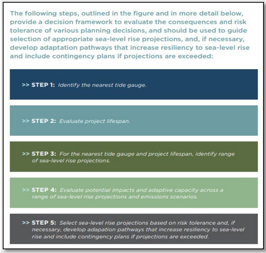
Figure 1: California’s “Risk Analysis and Decision Framework”

used when choosing an adaptation approach. Principles include prioritizing social equity, prioritizing protection of coastal habitats and public access, including adaptive planning, etc.