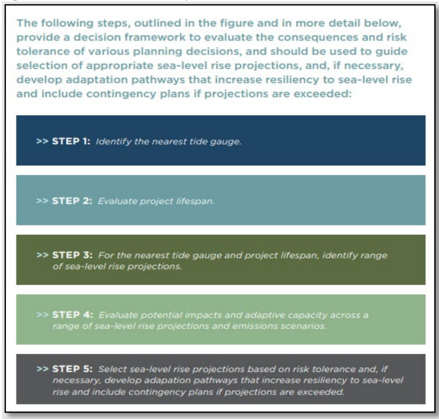
Figure 1: California’s “Risk Analysis and Decision Framework”

used when choosing an adaptation approach. Principles include prioritizing social equity, prioritizing protection of coastal habitats and public access, including adaptive planning, etc.