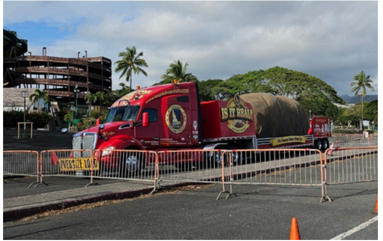
Hawaii Foodbank Drive Event