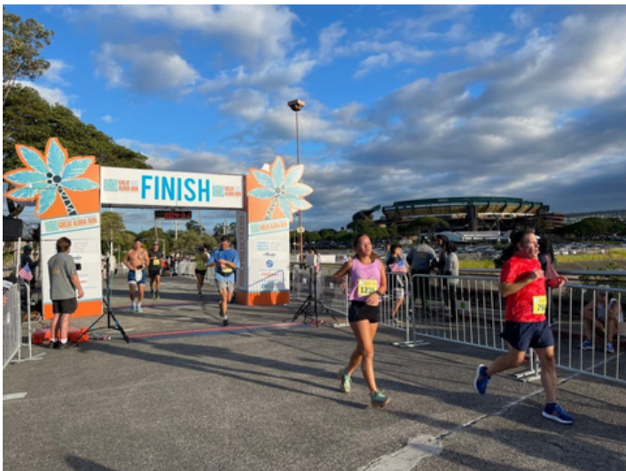
Great Aloha Run