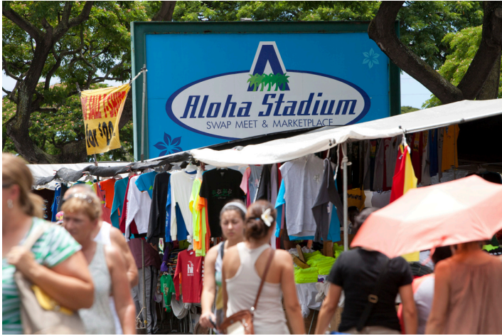
Swap Meet & Marketplace