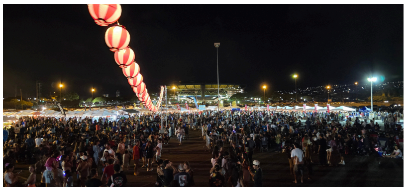
Megabon (Lower Halawa Lot)