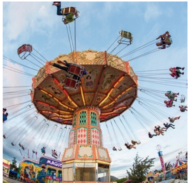
50th State Fair