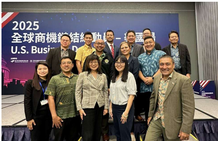
Delegation group photo at the U.S. Business Day event in Taiwan, highlighting Hawai'i's strong presence and ongoing collaboration with Taiwan.