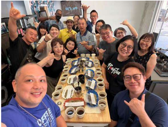
A group photo at the coffee tasting event, showcasing the diverse coffees from the farms visited during the mission.

exclusive week-long experience designed to highlight Hawai'i's renowned coffee industry. Organized by the Synergistic Hawai'i Agriculture Council (SHAC), the Hawai'i Coffee Association (HCA), and the Department of Business, Economic Development, and Tourism (DBEDT), this mission not only deepened Hawai'i's coffee connections but also featured Taiwanese coffee buyers, expanding Hawai'i's coffee presence in the Taiwanese market.