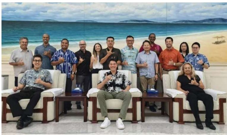
A group photo of the delegation in the Hainan Train Station waiting area.

During the visit, the delegation met with Hainan University and the Chinese Academy of Tropical Agricultural Sciences to discuss joint research initiatives, exchange programs, and collaboration in agriculture and education. A key highlight was a Coffee Tasting and Networking Event in Hainan, which introduced Hawai'i's coffee industry to key stakeholders in the region.