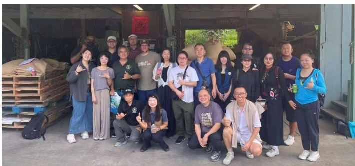
Group photo taken during our tour of the Wet Mill Certified Center, where we observed firsthand the standards and practices in sustainable production.

The mission offered a unique opportunity for international buyers to experience firsthand the exceptional quality and craftsmanship behind Hawai'i's coffee. Participants toured several of the Big Island's iconic coffee farms and roasters, exploring Hawai'i's distinct coffee production processes, sustainable farming practices, and the certification procedures required for exporting Hawai'i coffee to China.