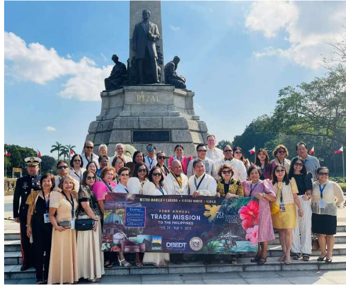
Trade Mission Delegates at Rizal Park in Manila