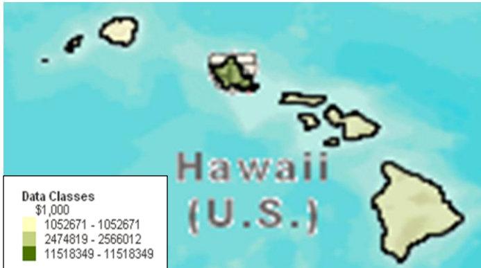
TOTAL RETAIL TRADE SALES IN HAWAII COUNTIES: 2007