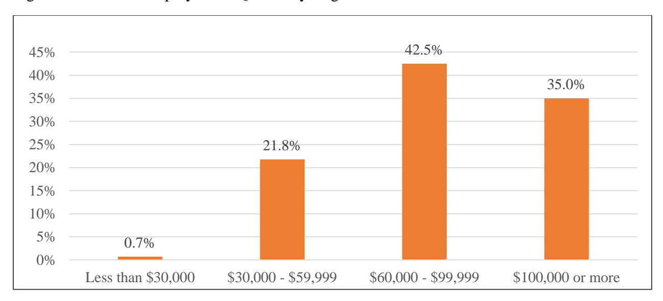
Figure 4. Full-time employees of QHTBs by wage level in 2013