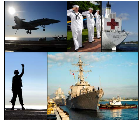
Saluting Our U.S. Navy