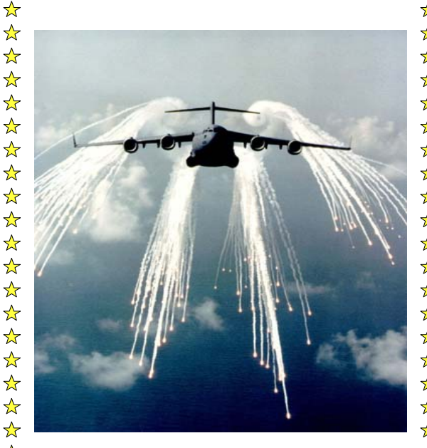
January 2005 r