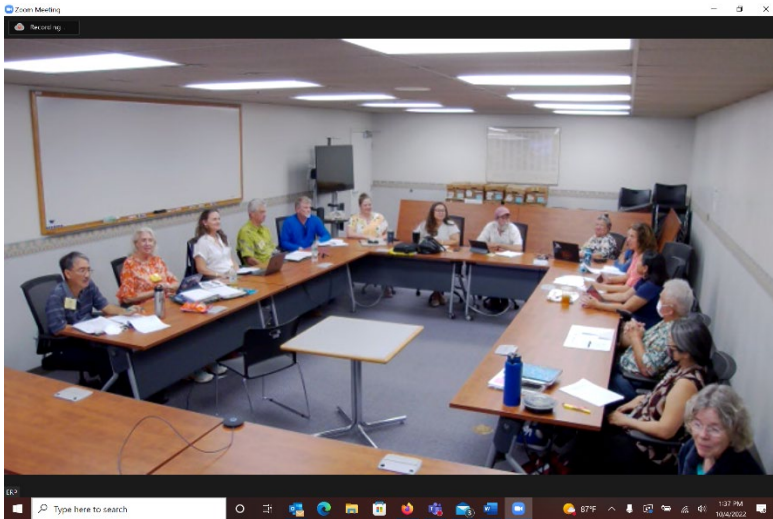
(Photo: The EAC’s first in-person meeting of 2022 on October 4, 2022, in the State Office Building, room 405.)

After filling three vacancies in 2022, the EAC now includes 15 members. These members come from diverse backgrounds and communities across the state bringing broad expertise to the EAC.