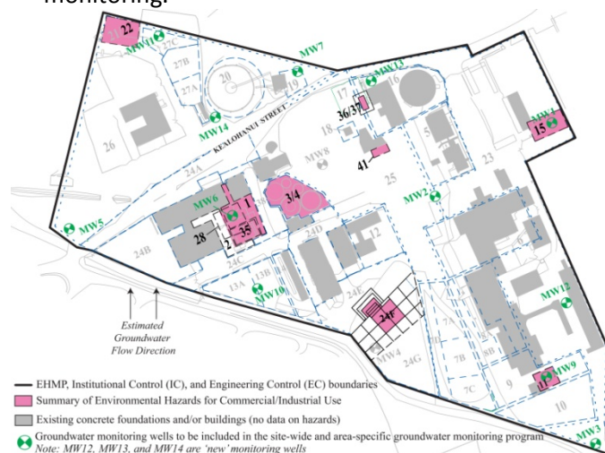
Figure 3: Preferred Remedial Alternative