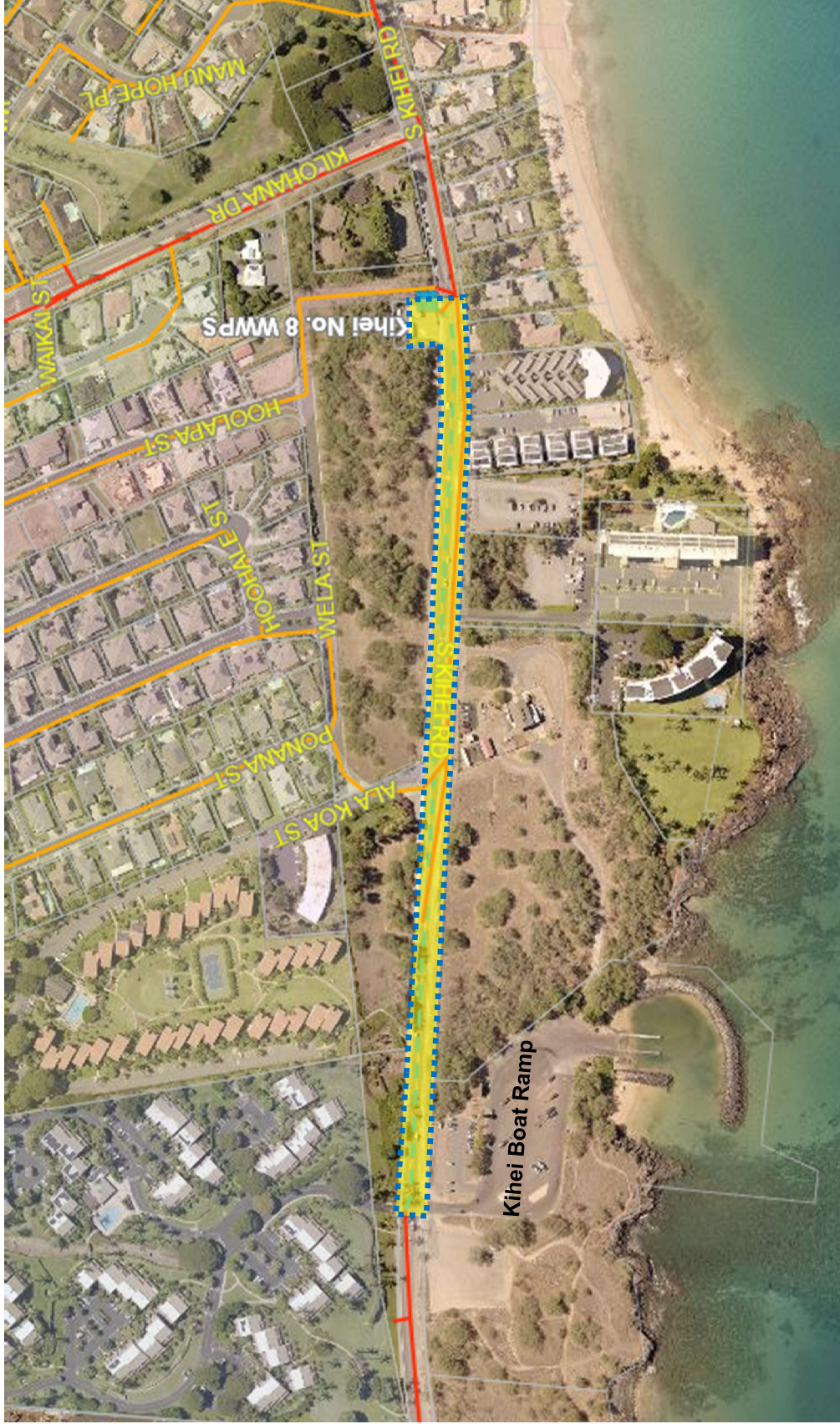
FIGURE 3 – AERIAL OVERVIEW OF PROJECT AREA