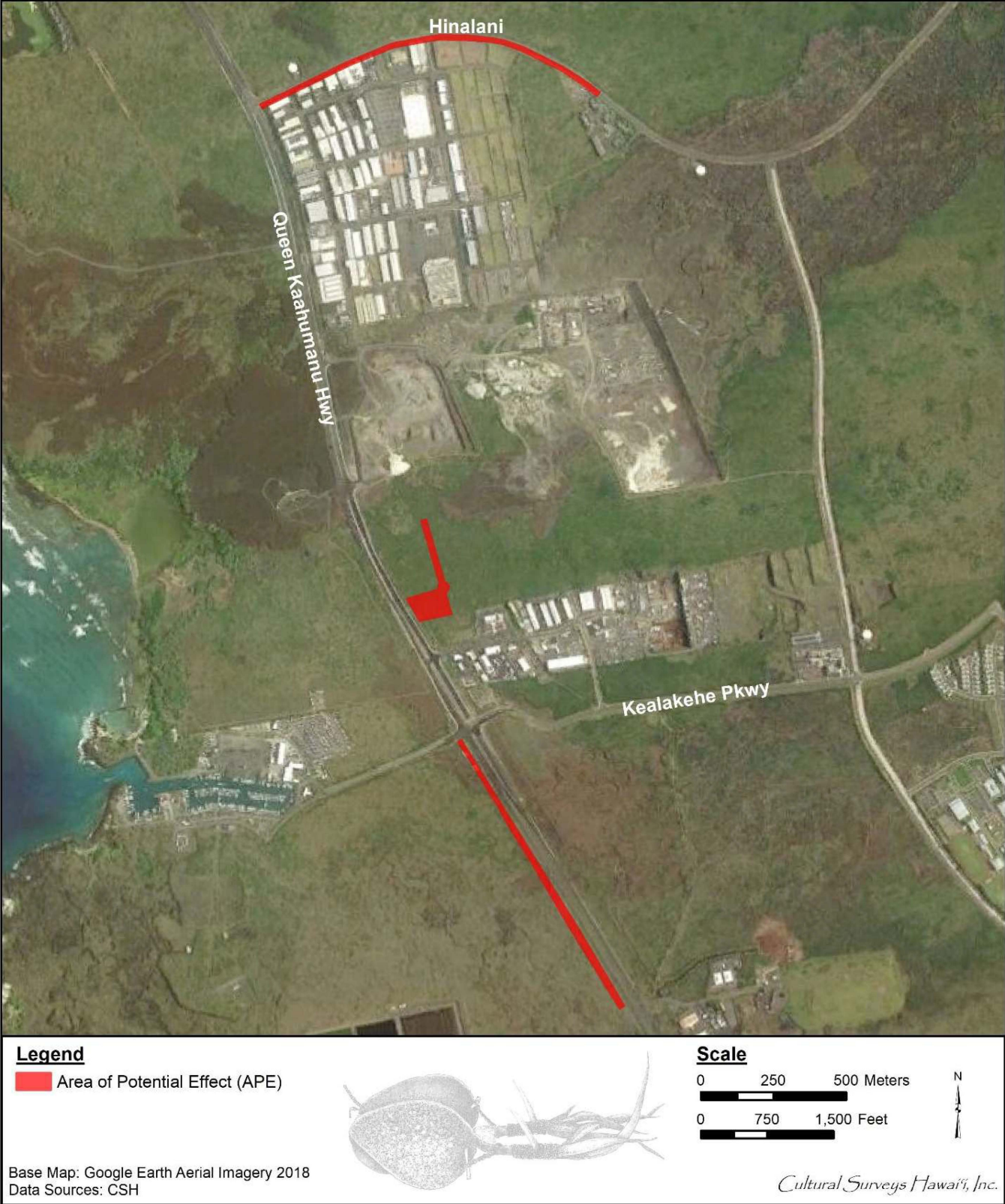
Figure 1. Aerial photograph showing the location of the APE