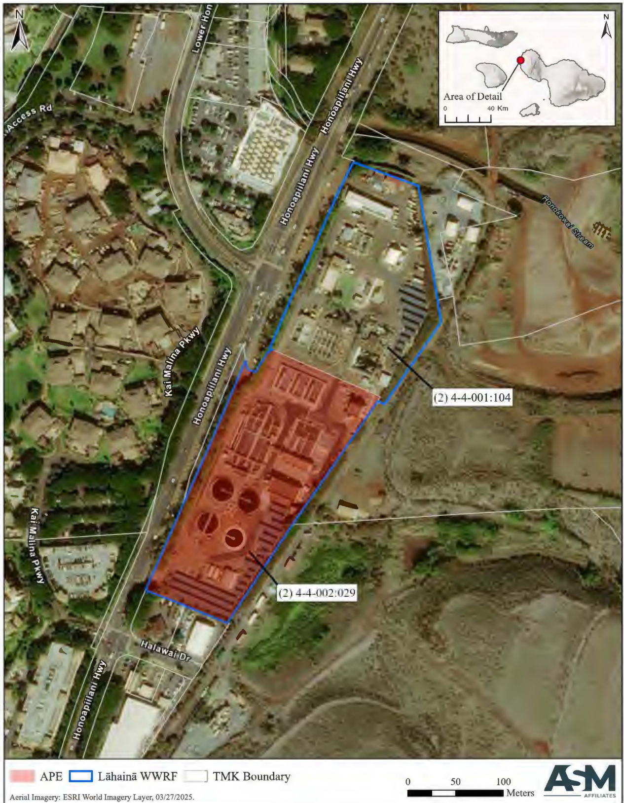
Figure 1. Satellite image with APE shown.