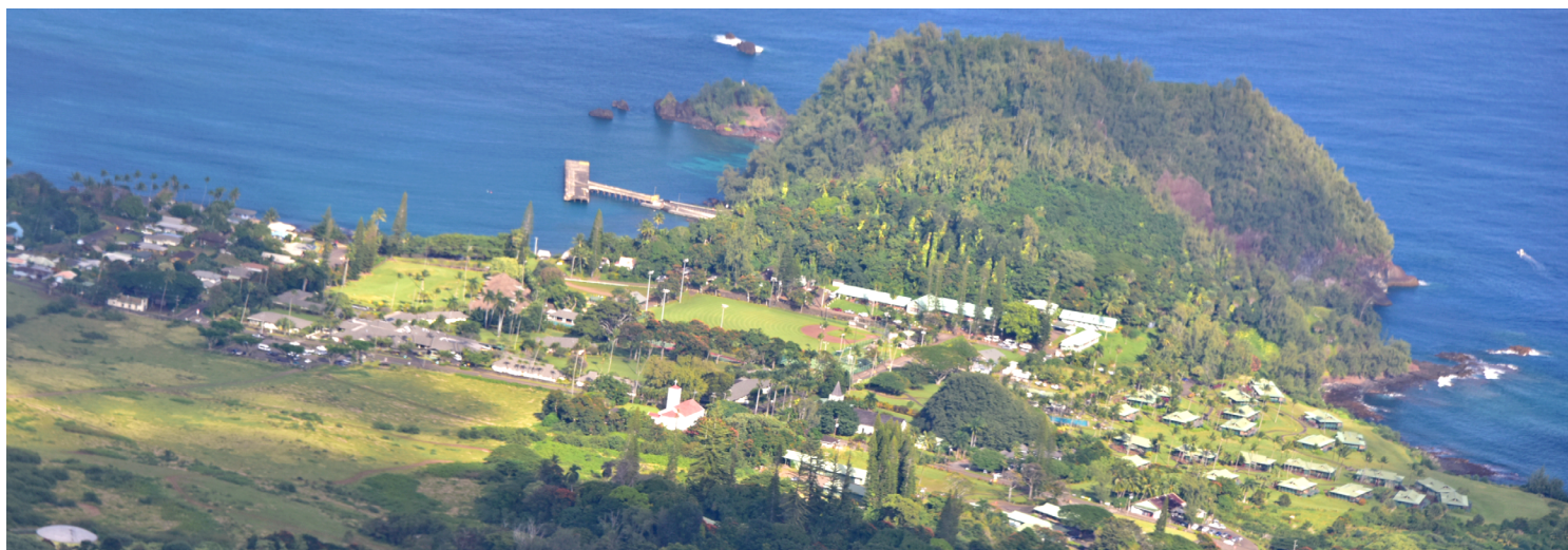
Aerial view of Hāna, Maui

Pursuant to HAR Section 11-200.1-11 , the State of Hawai'i Department of Land and Natural Resources has determined that additional environmental review is not required for the construction of a Rehabilitation Center at Hāna Health Community Health Center at Kawaipapa, Hāna, Maui, on Tax Map Key: (2) 1-4-003:024 (Parcel 24). A Finding of No Significant Impact (FONSI) was published in The Environmental Notice on December 8, 2004 , for a much larger Community Health and Wellness Village (Wellness Village) on Parcel 24 and an adjacent parcel designated as Tax Map Key: (2) 1-4-003:022. The proposed Rehabilitation Center serves one of the functions contemplated by the Wellness Village, but is a much smaller project on Parcel 24 only.