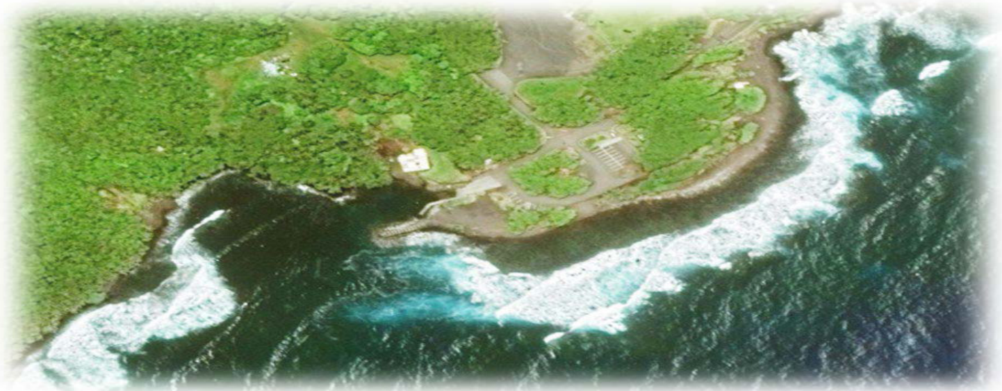
Pohoiki Boat Ramp in 2018 (open and functional before the recent volcanic eruption)