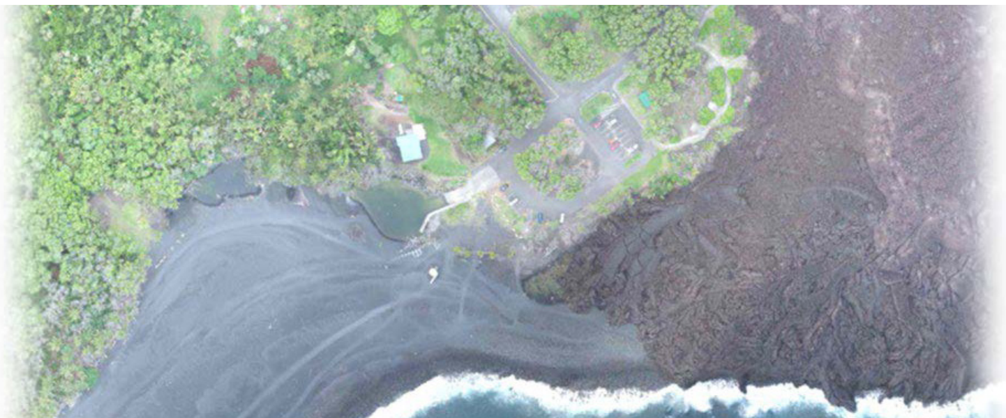
Pohoiki Boat Ramp in 2022 (blocked after the recent volcanic eruption)