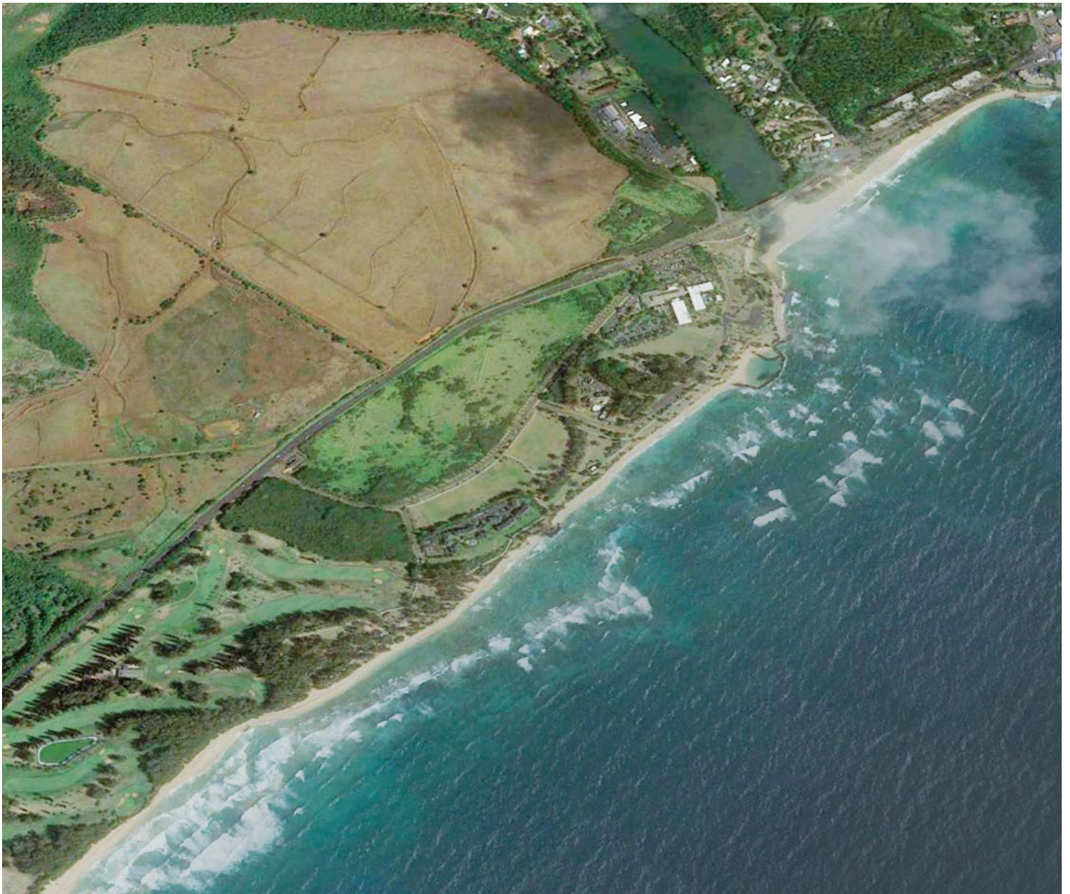
Aerial image of the Lihu'e coast.