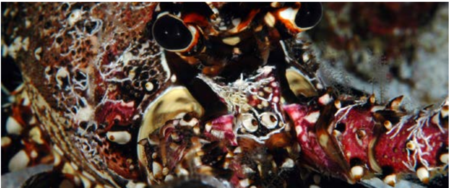
A close-up of the face of the Hawaiian spiny lobster ( Panulirus marginatus )

NMFS establishes the annual harvest guideline for the commercial lobster fishery in the Northwestern Hawaiian Islands (NWHI) for calendar year 2023 at zero lobsters. Please click the title link above for further details.