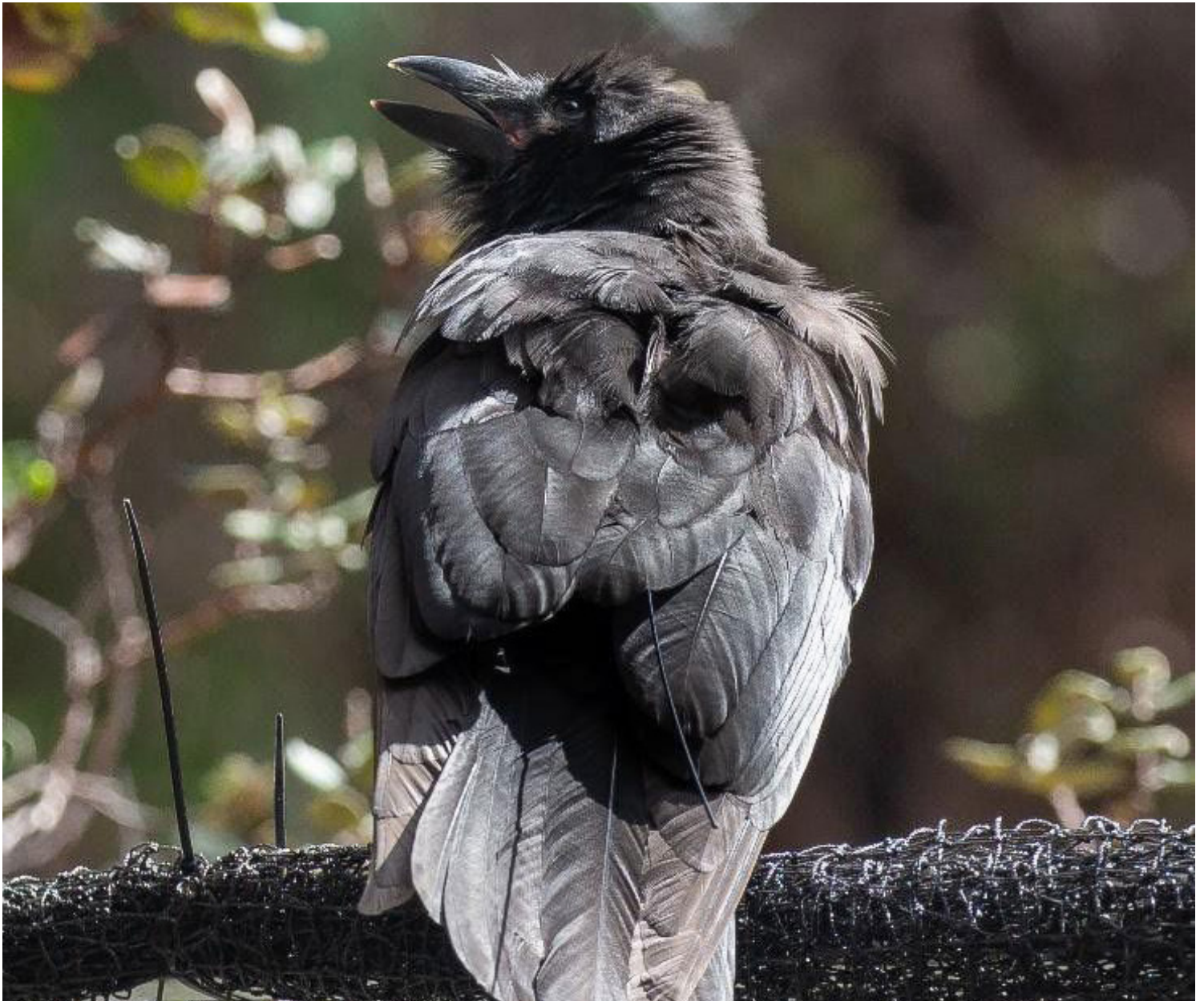
A pilot project will evaluate the suitability of east Maui as habitat for 'alalā, or the endangered Hawaiian crow