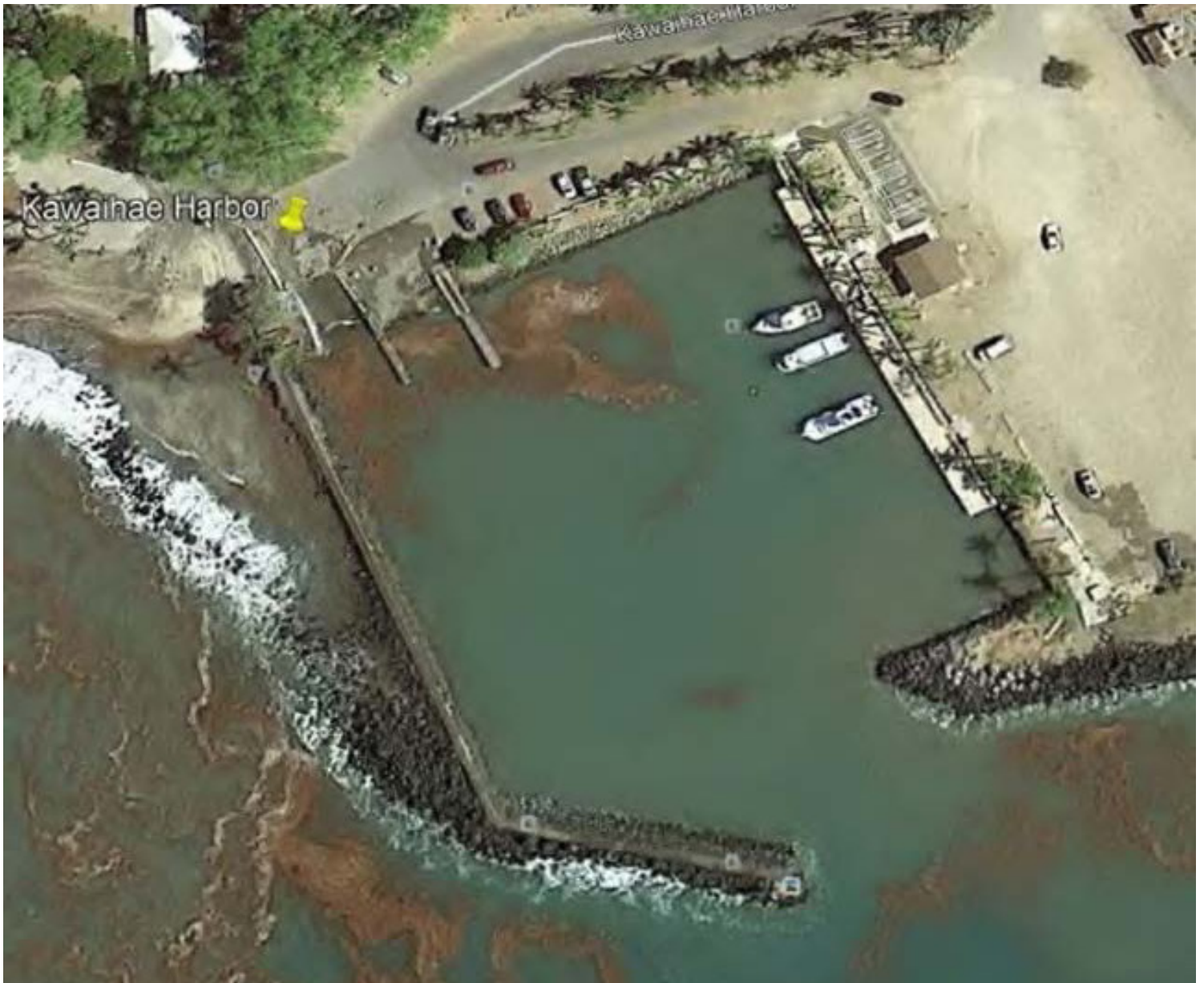
Breakwater improvements are proposed to improve conditions for the North Kawainae Small Boat Harbor