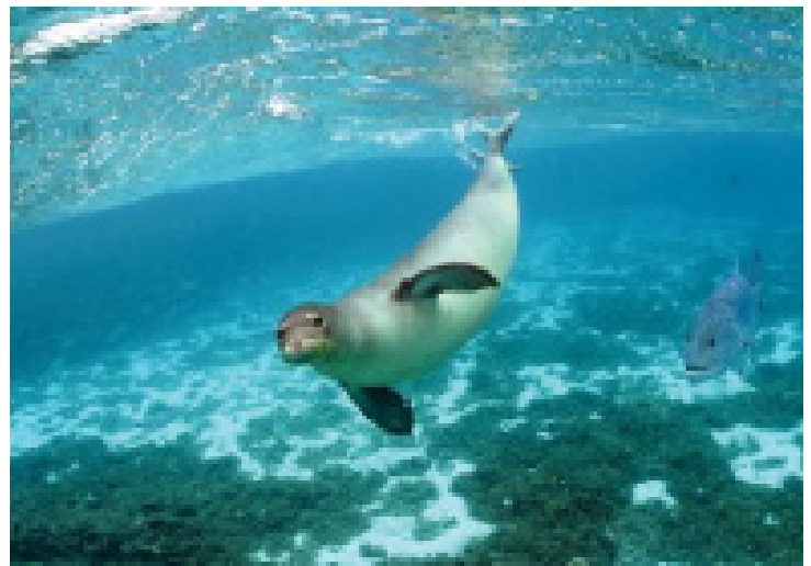
Images from above and below the surface in the Papahānaumokuākea Marine National Monument, which is proposed to be redesignated as a National Marine Sanctuary