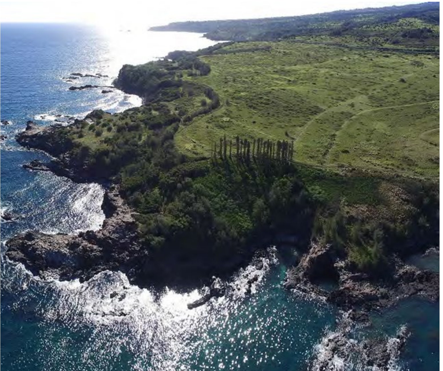
The Honolua to Honokōhau Management Plan Area is located on the west coast of Maui.