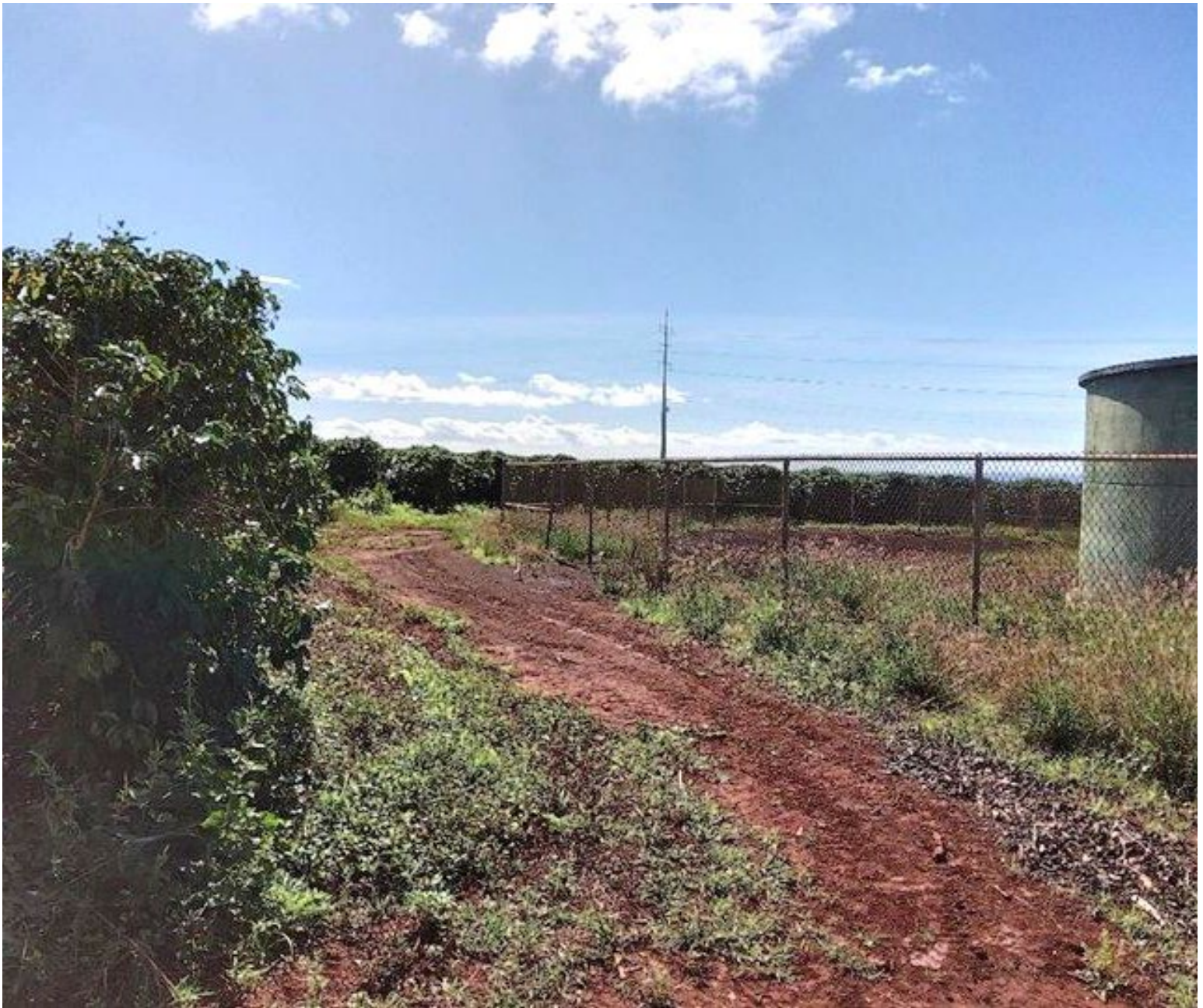
The project proposes to provide additional water storage to the Lima Ola subdivision on Kaua'i.