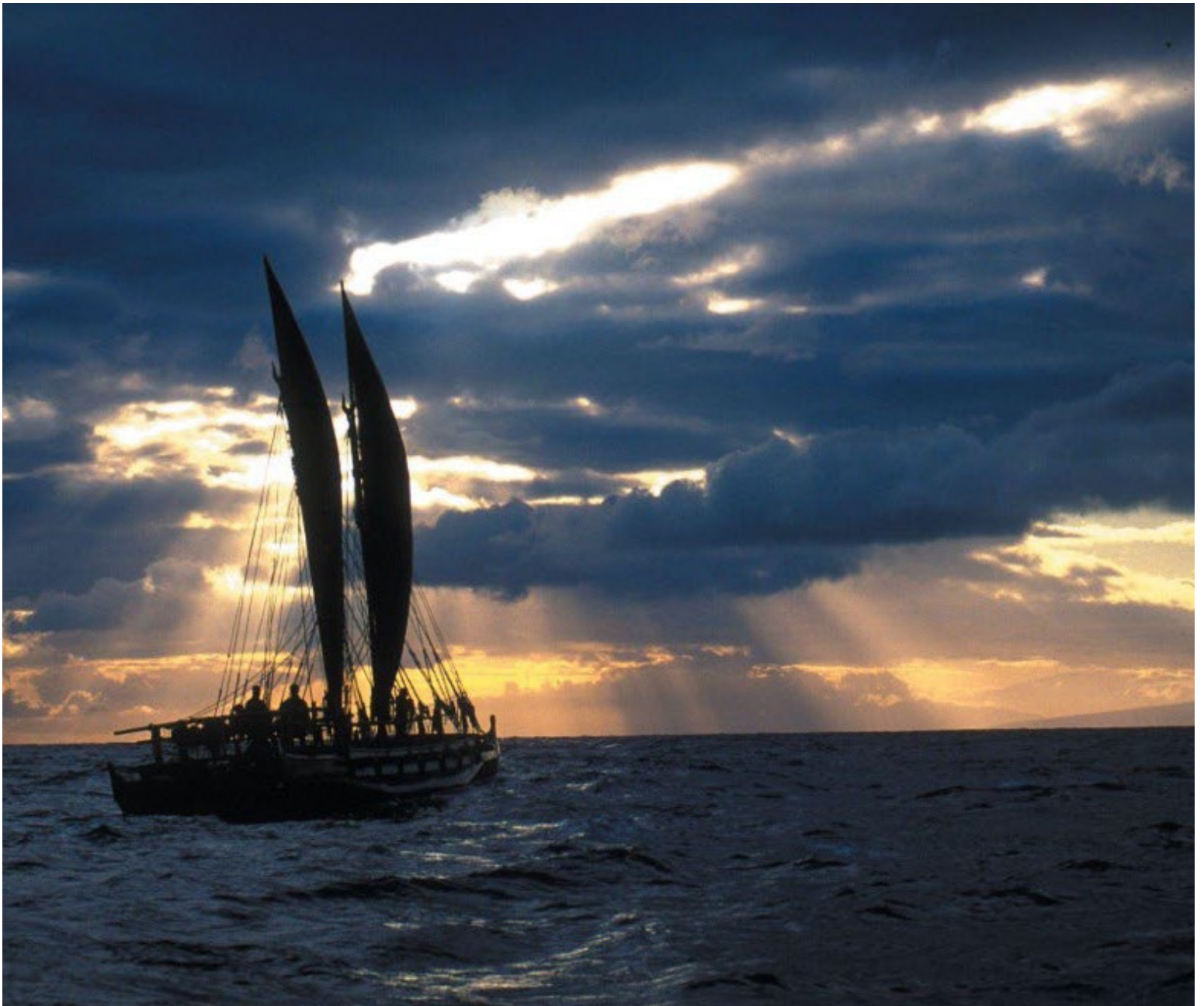
A Hawaiian voyaging canoe travels through Papahānaumokuākea.