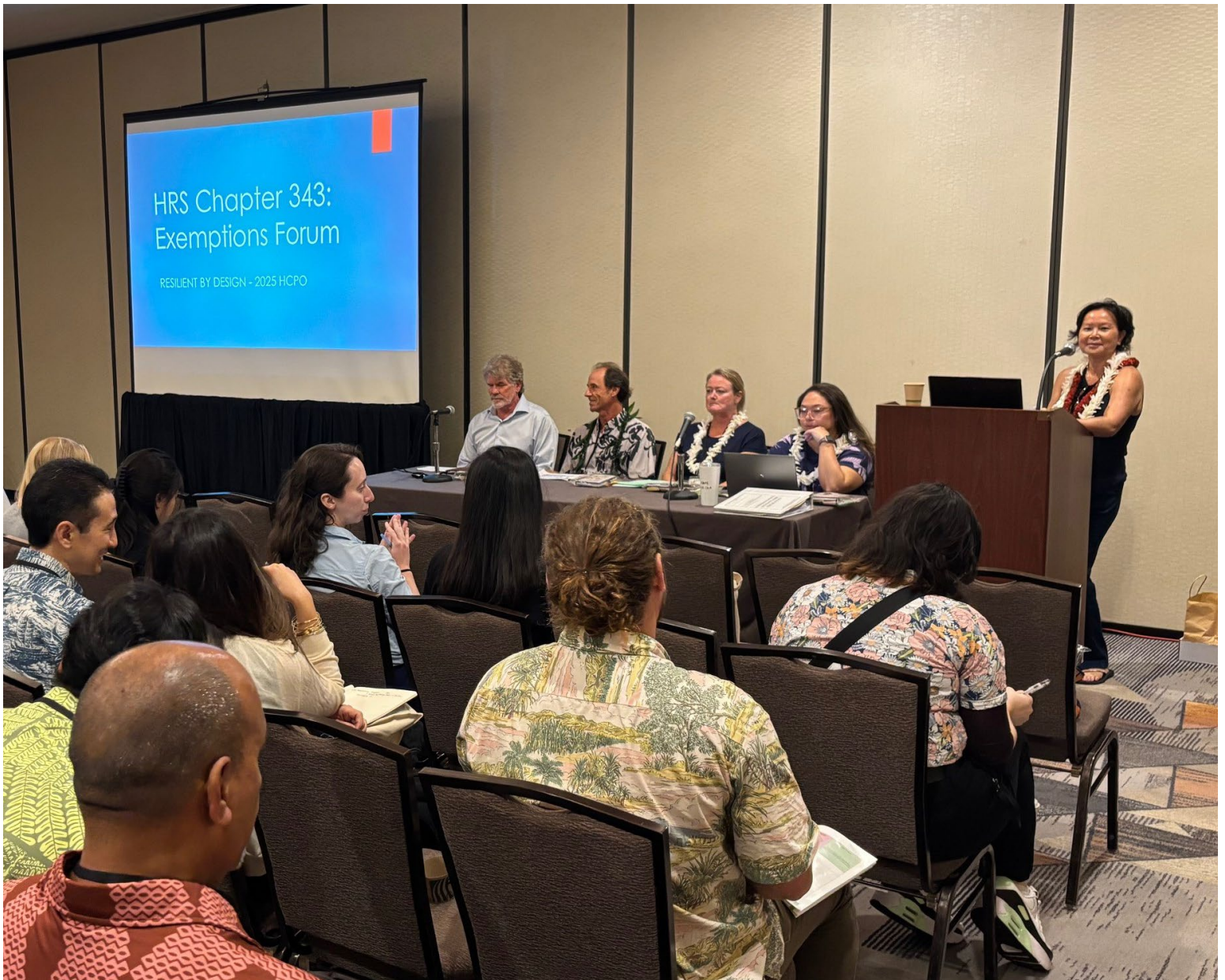
Photo taken from the EAC Exemptions Forum at the 2025 Hawai'i Congress of Planning Officials.