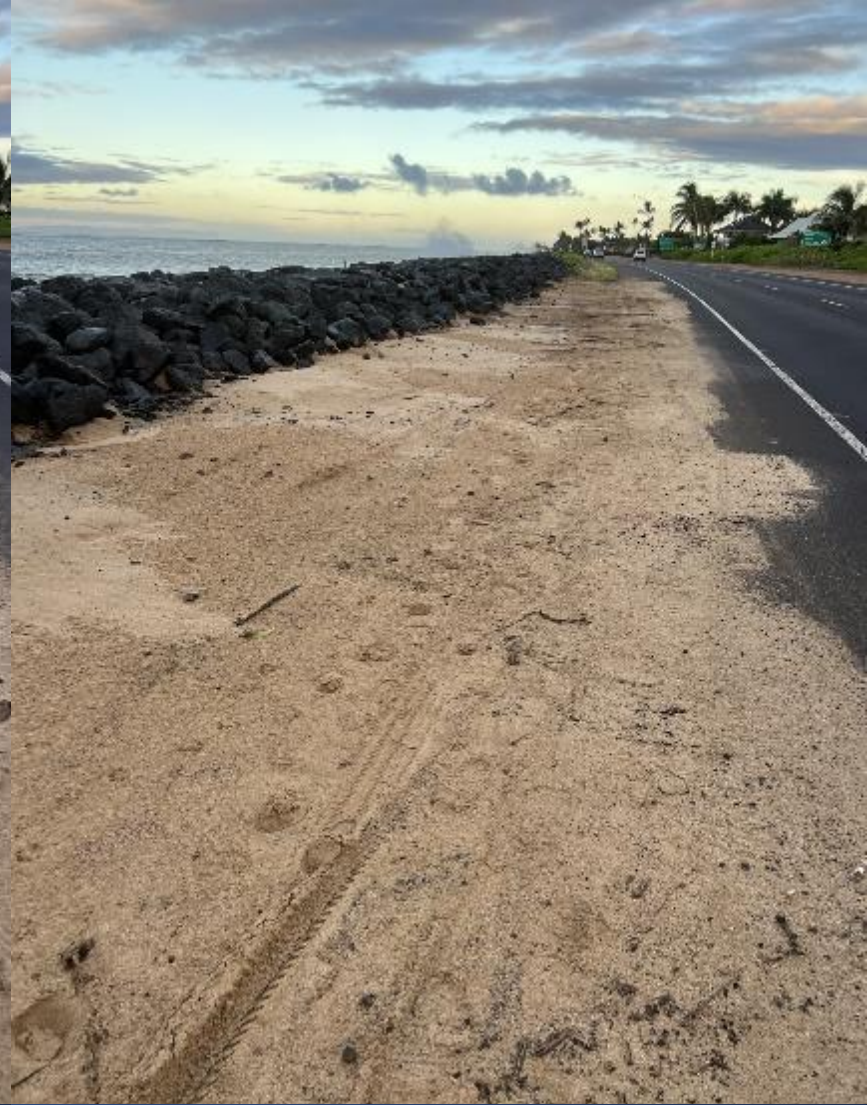
Kekaha, Kauai Near mile marker 26