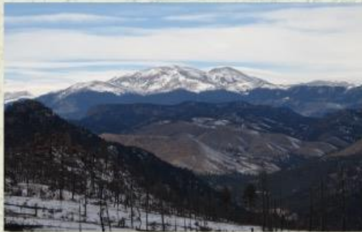
MT. BLUE SKY