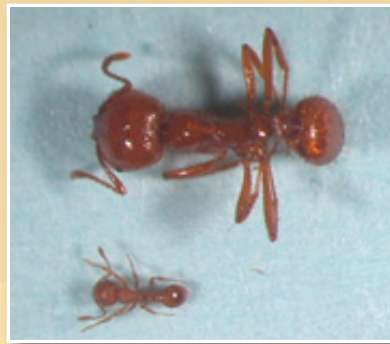
Tropical fire ant (top) compared to LFA (bottom)