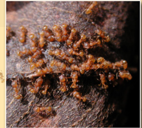
Hawaii Department of Agriculture

Stop the spread of the little fire ant (LFA) in Hawai'i