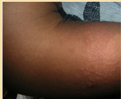
LFA deliver a powerful sting causing large, painful welts

LFA easily fall off disturbed branches and leaves, stinging those who brush by.