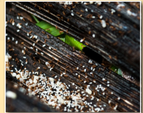
LFA colony in leaf litter

An entire LFA colony can fit inside a macadamia nut shell. The ants can build colonies in any small empty cavity: under or in logs, branches, plant debris, rocks, or even inside furniture.