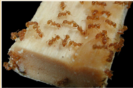
Ellen Van Gelder, USGS

The first infestations of LFA were discovered on Hawai'i island in 1999. LFA have hitchhiked on material from infested areas and are now spreading across the Big Island. Newly introduced and controllable colonies of LFA have been found on Kaua'i and Maui.