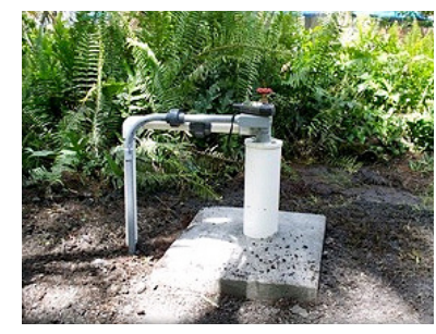
Domestic use water well.