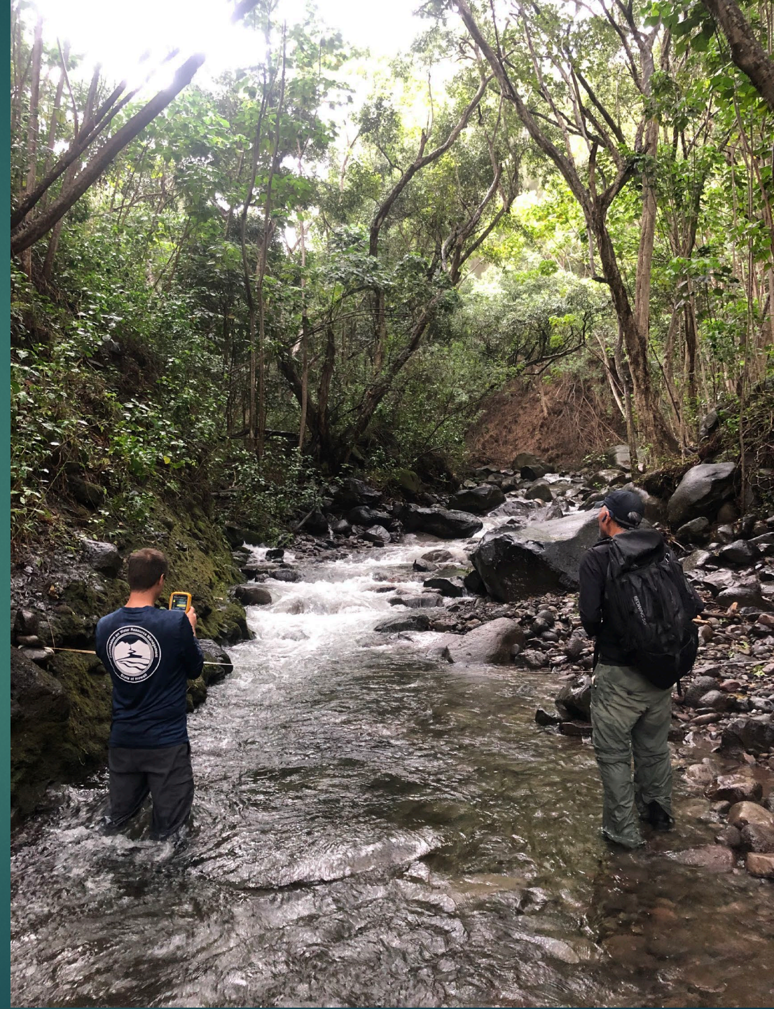
Waikapū Stream, Nā Wai 'Ehā