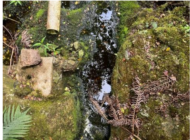
Close view of diversion dam and disconnected pipe on left bank of stream.