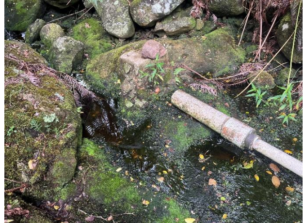
Upstream view of diversion dam and disconnected pipe.