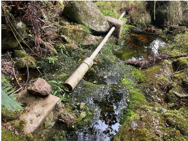
Downstream view of diversion dam and disconnected pipe.