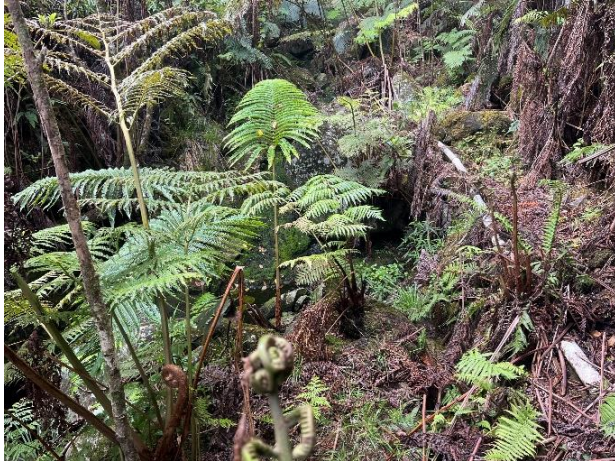
Diversion pipe from diversion dam.