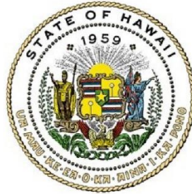
JOSH GREEN, M.D. GOVERNOR