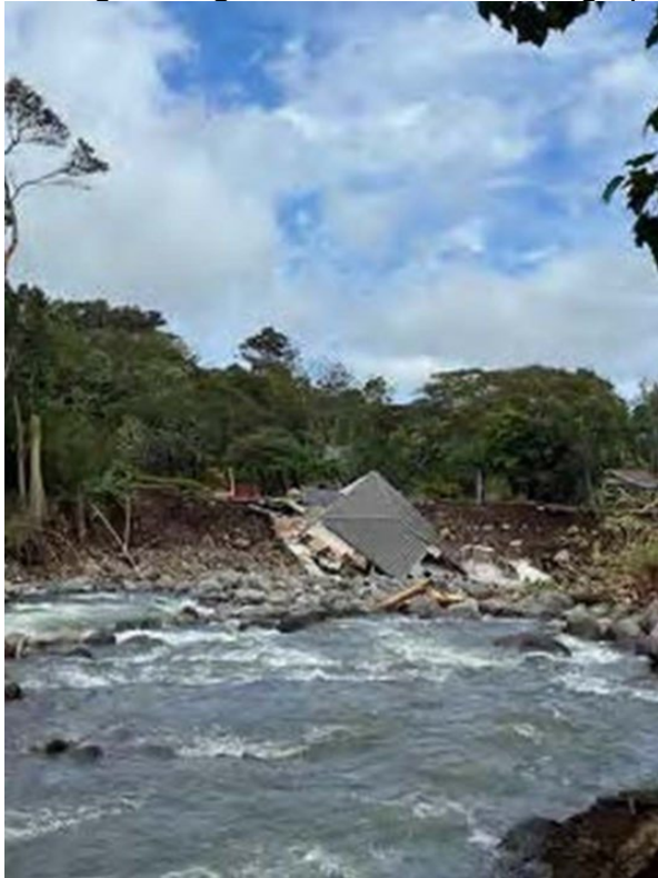
Figure 2a (left). View of Bashaw property damage on right bank of river, from the opposite right bank of Wailuku River. Figure 2b (right). View of Bashaw property damage on right bank of river, looking upstream.

The flood impacted approximately 160 linear feet of river fronting the Bashaw property. The Bashaws lost their home in the flooding and sought to prevent further damage to their property including threats to their septic system which was within 15 to 20 ft. of the river bank, along with barn/shop building approximately 90 ft. from the river bank.