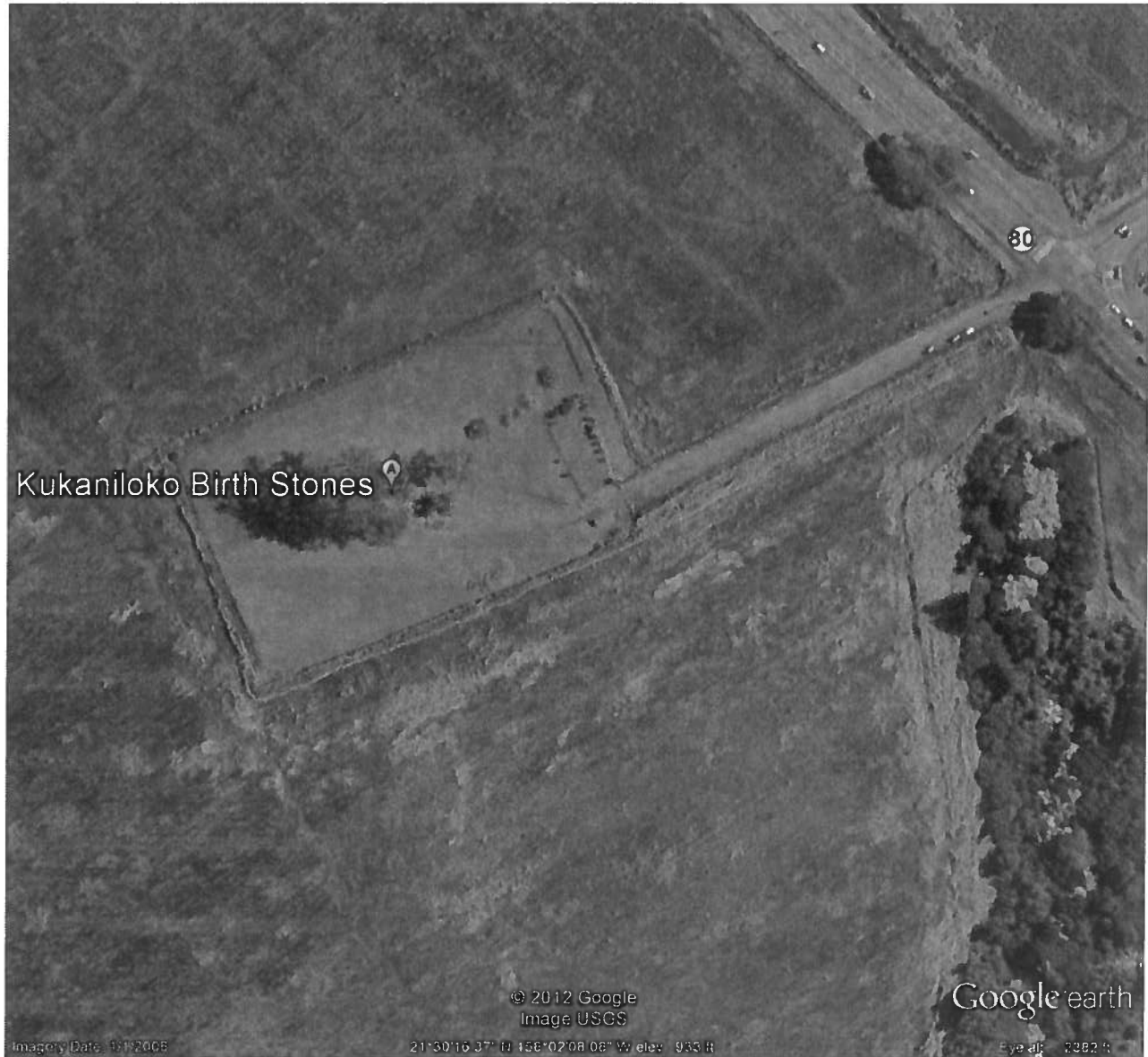
EXHIBIT B Aerial View of Kūkaniloko Birthstones Site TMK: (1) 7-1-001:004